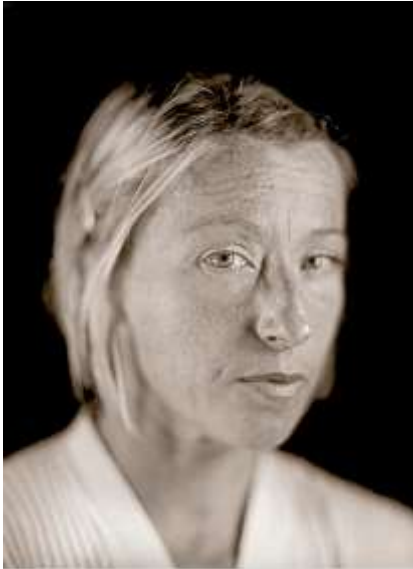
Figure 3. Title: Cindy Sherman, 2000, Photographer: Chuck Close, Shallow DOF Technique, 165x216 mm, and Unique Daguerreotypes