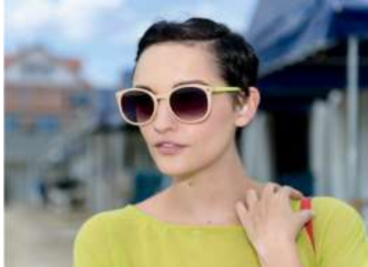
Figure 1. Using Wide Aperture of f/2.8 the DOF is now very Shallow and everything but the Model Falls out of Focus