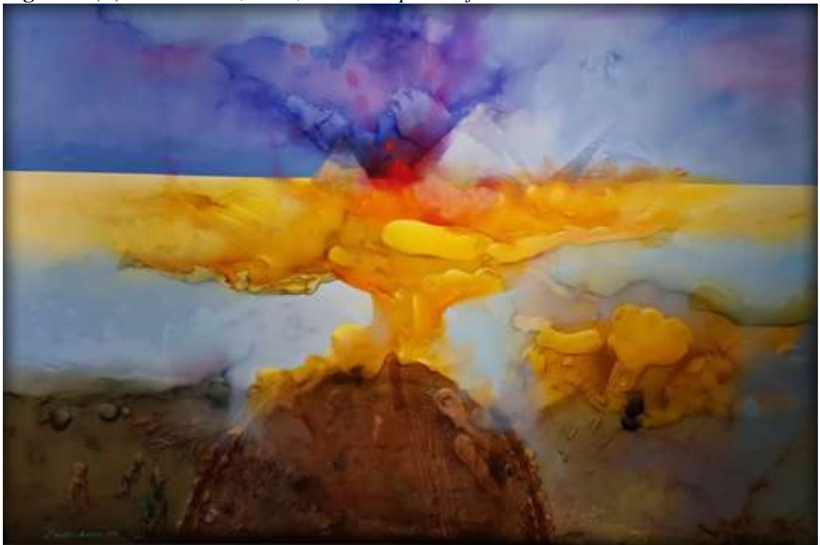
Figure 6. (a) Without title, 2017, Artist: Stephan – from Macedonia