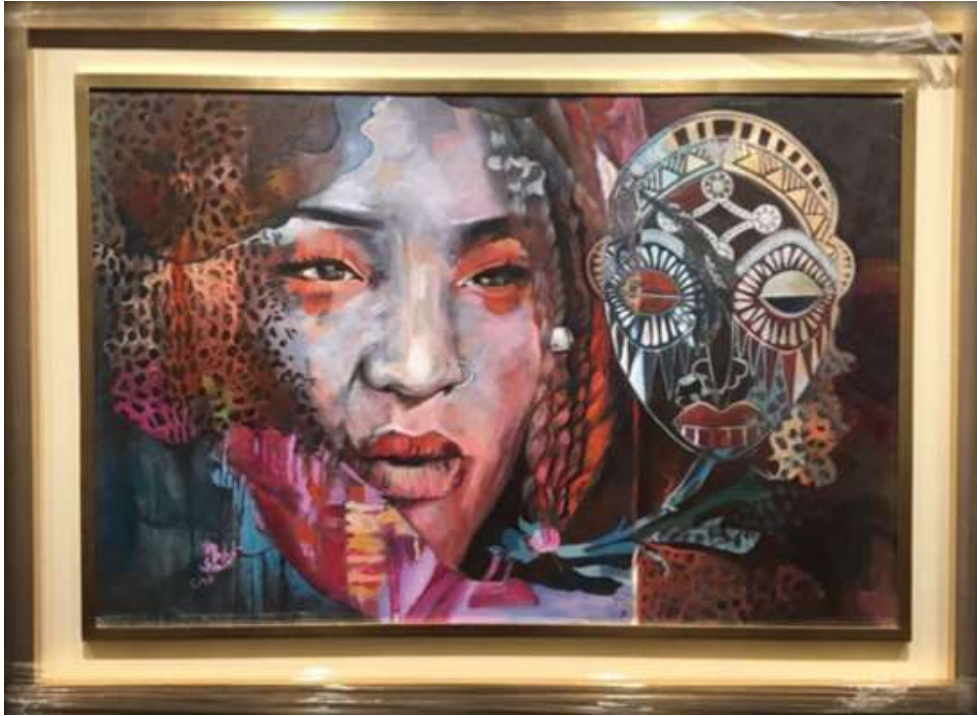
Figure 11. (b) Title: Spiritual Inspiration 2017 , Artist: Fatma Hamdy – Cairo, Egypt