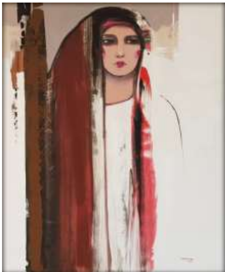
Figure 9. (b) Without title , 2017, Artist: Fahd Al-Hgilan – from Kingdom of Saudi Arabia