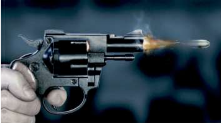
Figure 5. Title: Close-up of a bullet coming out of a gun, Photographer: Cocoon

Source: Richard Salkeld, Reading photographs 2014, Ref. [1].