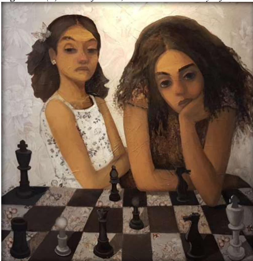
Figure 10. (b) Title: Life 2017 , Artist: Randa Fakhry – from Cairo, Egypt