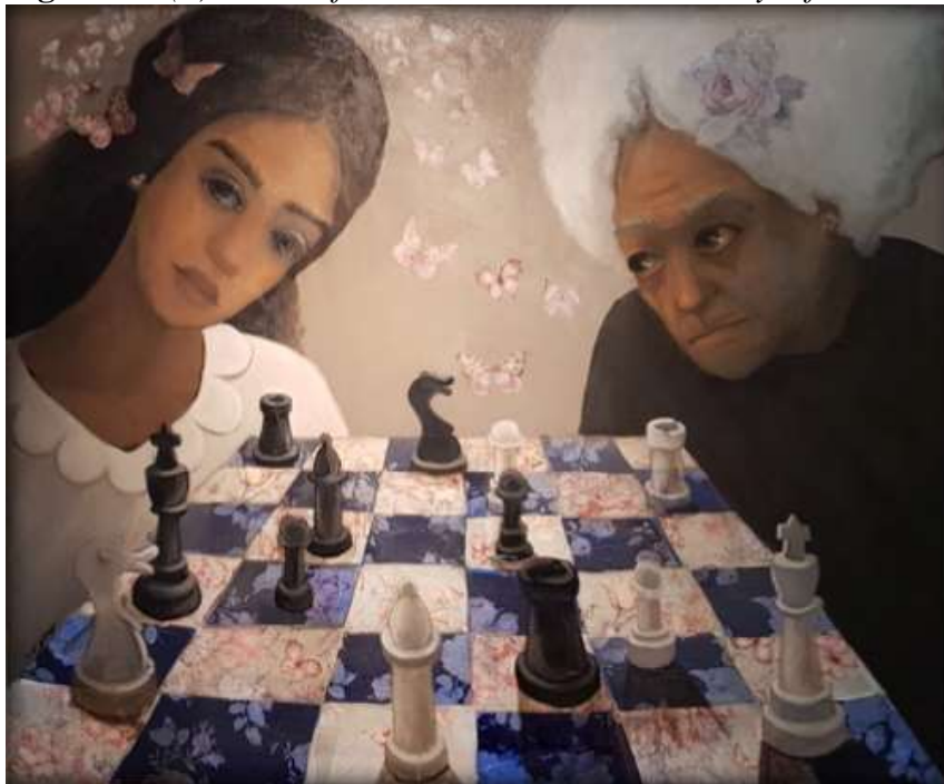
Figure 10. (a) Title: Life , 2017, Artist: Randa Fakhry – from Cairo, Egypt