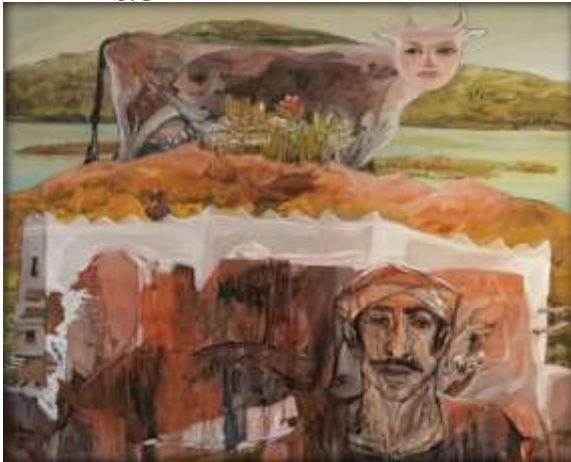
Figure 7. (a) A Body Music in an Ancient House , 2017, Artist: Mohamed Oraby – Luxor, Egypt