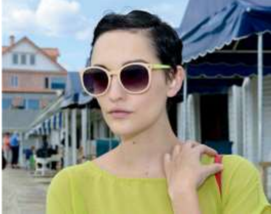
Figure 2. Using Small Aperture of f/16 has a Wide/strong DOF, Rendering Everything in Focus, Including Distracting Background Elements