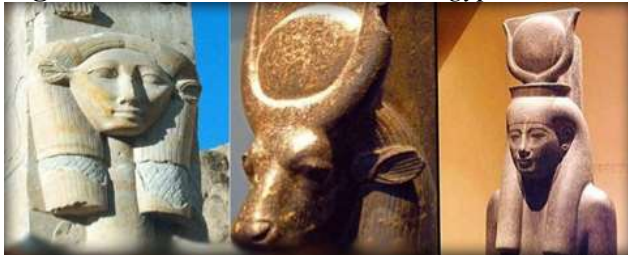
Figure 8. Title: Hathour, Luxor, Egypt