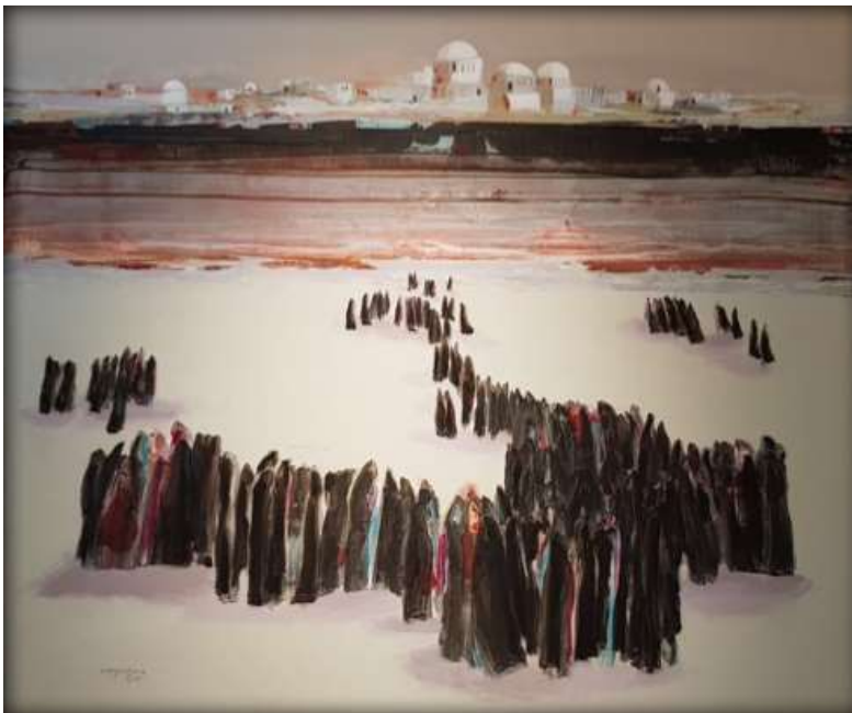
Figure 9. (a) Without title , 2017, Artist: Fahd Al-Hgilan – from Kingdom of Saudi Arabia

Source: Fatma Hamdy, Captured in Symposium Madinaty, 2017