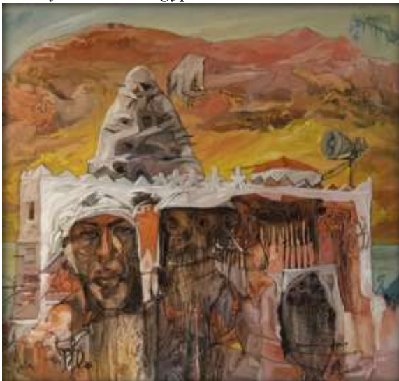
Figure 7. (b) A Body Music in an Ancient House , 2017, Artist: Mohamed Oraby – Luxor, Egypt