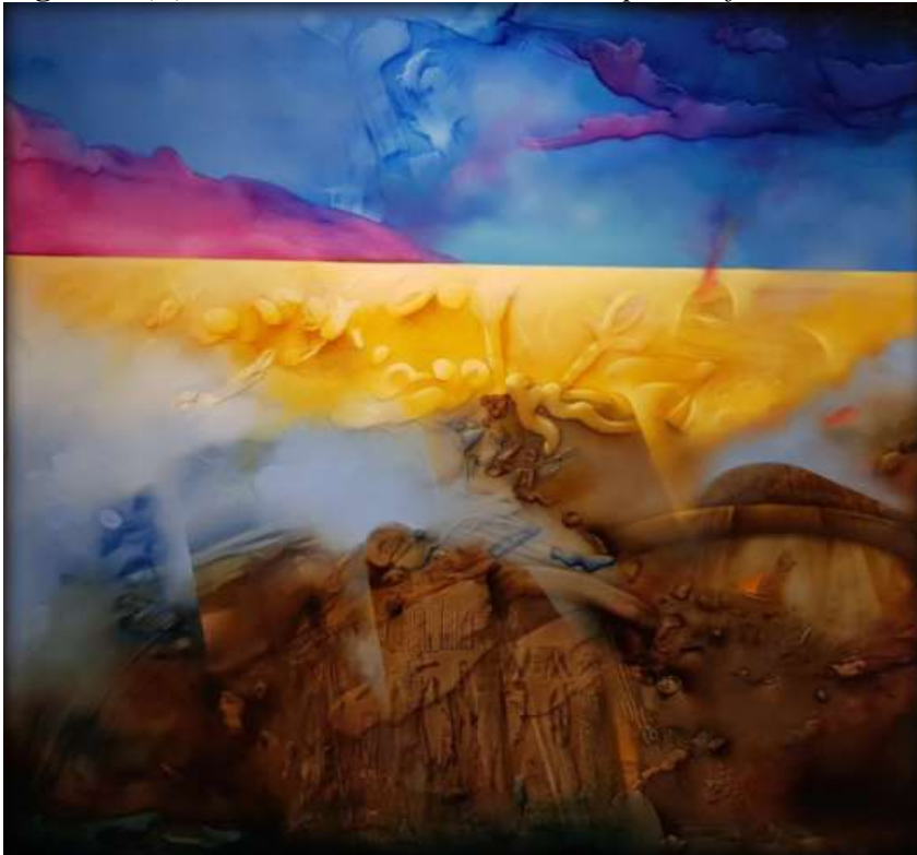
Figure 6. (b) Without Title, 2017, Artist: Stephan – from Macedonia