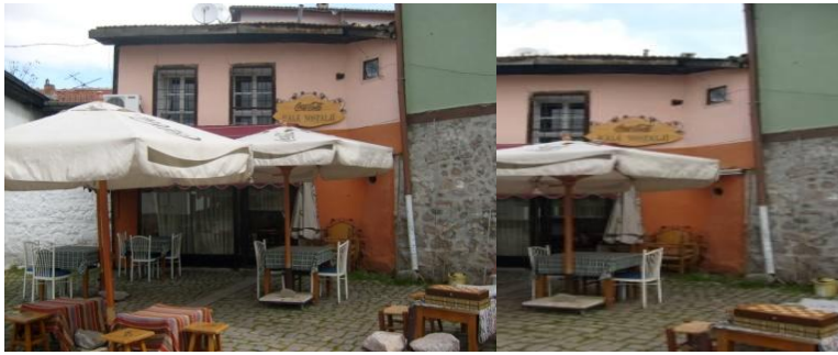
Figure 6. Images from the 2 nd Case (2014)