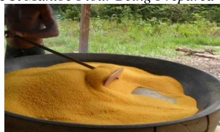
Figure 5. Manioc Flour Being Prepared