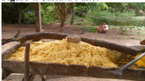
Figure 4. Cassava Paste.