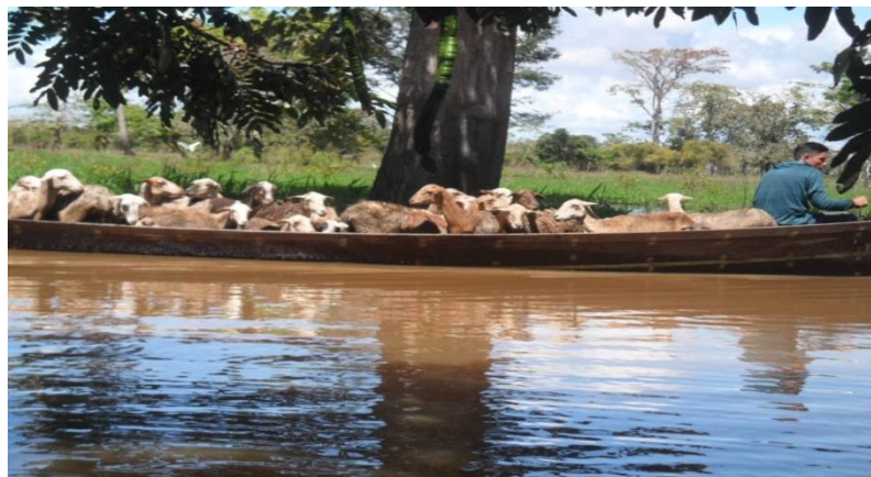
Figure 2: Animal Transportation from Floodplain to Ashore due to River Flood

The local people practice ecology with no reading the academy manual. It doesn't constitute a romantic vision of this relation, but give the people's way of life credit for their secular traditions of relation with the nature.