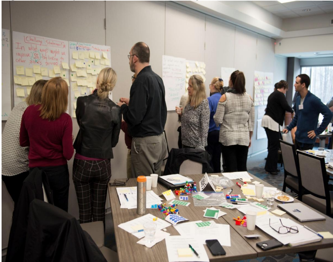
Figure 6. Picture from Creative Problem Solving

The third phase of the CPS workshop involved development and refinement of the chosen solutions into more robust, concrete social innovations that could then be framed as fundable solutions to food insecurity in Halton. Here, the team of facilitators helped groups to negotiate a variety of tools to evaluate the components, resources, and limitations of the chosen alternative by, first, getting groups to articulate how their chosen solution would actually work by explaining 5-7 key features of their ‘social innovation’ and then engaging in a ‘stakeholder analysis’ activity to identify the key actors and their roles and expected contributions, as well as any anticipated challenges involved in the execution of this targeted solution. The workshop ended with participants being given 25 minutes to develop a ‘2-minute pitch’ for their group’s targeted – and fundable – solution to food insecurity in Halton.