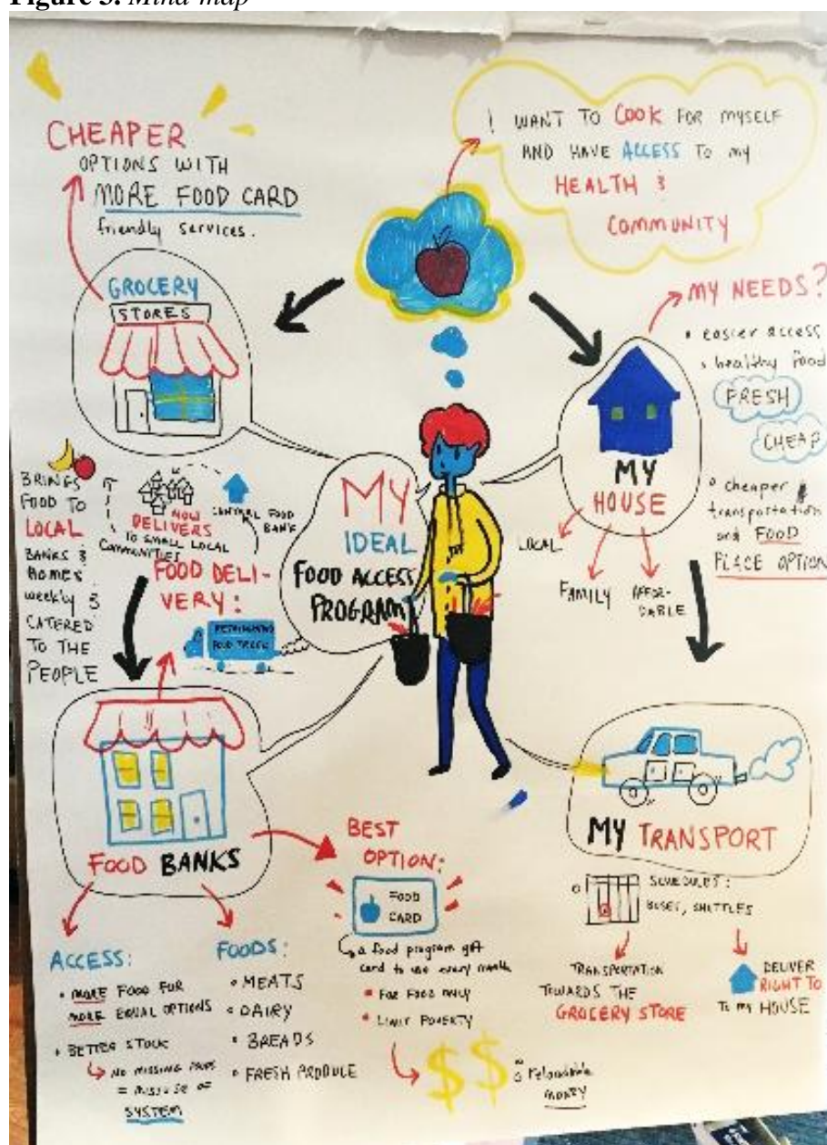
Figure 3. Mind-map

Building on this point, overall, participants recognized that food programs associated with low income housing locations are ideal because food is delivered directly to the location, thereby preventing the difficulties some residents experience from having to make their ways to and/or search out food service programs. The most common suggestion within this transportation/access theme was to offer food delivery services, especially for elderly neighbours, lone parents of young children, and/or for people with any type of disability.