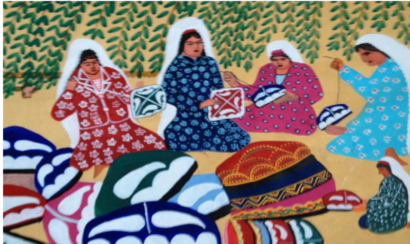
Figure 3. Salat Zayit Embroidery Women