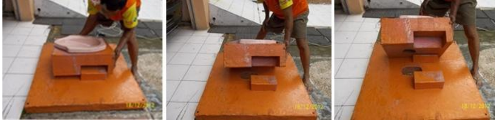
Figure 1. The "BALatrine" Showing Removable Porcelain Bowl

In addition to a simple "technical" intervention, and congruent with key features of a socio-ecological approach, the BALatrine is designed to be adopted at the household or family level and therefore, through the process of empowerment, requires the engagement of householders at a number of points. This includes, for example, their personal ownership of the decision to invest time and money in a household latrine; to install it; and to use and maintain it in a hygienic and healthy manner. It effectively shifts villagers from a pre-contemplation, or contemplation stage of change, to participatory action and engagement. At the household level, when a family makes the decision and the financial investment to build a family latrine, the owner will choose to build it near his house. The personal ownership of the latrine and the investment of both time, effort and resources usually means regular use and better maintenance. For example, when a child uses the latrine and does not flush it, the whole family accepts responsibility for latrine hygiene. This in turn will mean better hygiene and better health for the whole family.