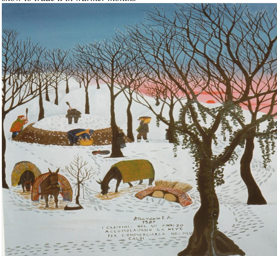
Figure 2. Antonino Mancuso Fuoco, The Capitini in the 1920s accumulated snow to trade it in warmer months

There is a toponym on the Etna volcano that recalls this activity. The woodland belt, which arrives at height of about 2000 meters, reaches the caves or Fosse della Neve.