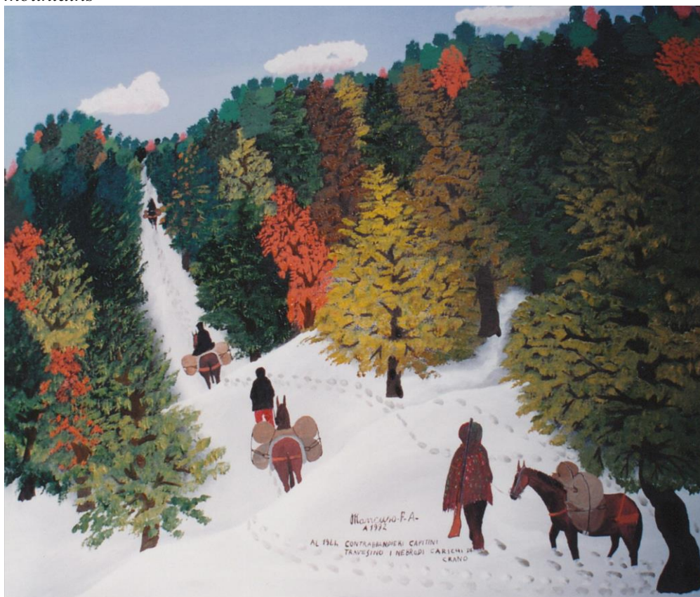
Figure 7. Antonino Mancuso Fuoco, Capitini smugglers cross the Nebrodi mountains

The snow trade in the Catania area allowed great gains, wealth and luxuries to a small class of contractors, and simple earnings for a normal life for many others. For centuries the roads of the cold were in ferment; the snow, turned into ice in the volcano, was taken to the seaports from where it left for other Sicilian centers and abroad. This flourishing activity continued until the first half of the 20th century, when it had to surrender to the competition of industrial ice, disappearing from the market stalls and from the memory of the people.