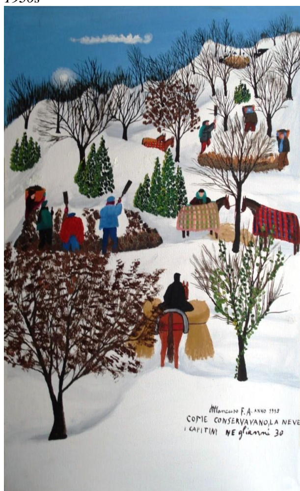
Figure 4. Antonino Mancuso Fuoco, How the Capitini stored the Snow in the 1930s

Nevertheless, the city was not equipped for snow conservation, as shown by an episode reported by a local chronicler. New Year's Eve in the 1700 was stiff due to the cold caused by the snow flocked in large quantities over the city and the countryside. The snow reached 25 centimeters in height and in the streets barely one could walk; it lasted several days. Many people and entire religious houses wanted to make provisions for the summer, but they lost the expenses and the labors, because for lack of suitable pits, they did not even find the water 14 .