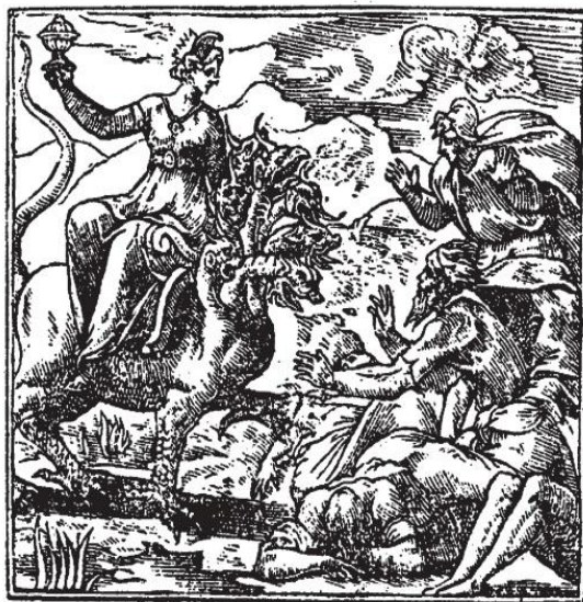
Figure 6. “GOD OR RELIGION: Fake Religion” ,

Source: Anonymous, 1558, Engrave M. Andrea Alciato. Toutes les emblems. Lyon, 24.