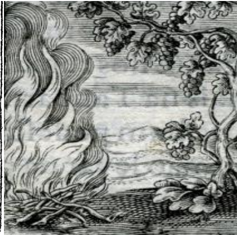
Figure 8. Detail of Arch of the Familiars of the Holy Office of Lisbon: The Good and the Bad Vineyards

Viagem da Catholica Real Magestade del Rey D. Filipe II N.S. ao Reyno de Portugal. Lisboa, 52v.