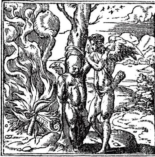
Figure 7. “Love: Against Love”

Source: Anonymous, 1558, Engrave M. Andrea Alciato. Toutes les emblems. Lyon, 141.