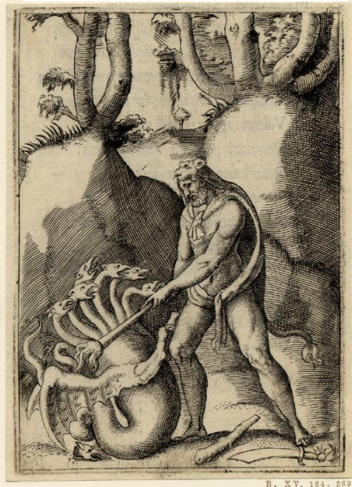
Figure 11. Hercules Killing the Hydra of Lerna

Source: Anonymous, 1555 Engrave The British Museum, London, United Kingdom