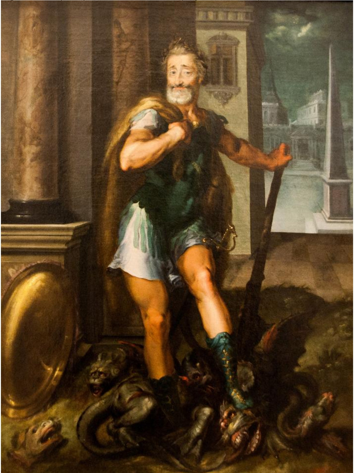
Source: Circle of Toussaint Dubreuil, Circa 1600, Oil on canvas, Musée du Louvre, Paris, France