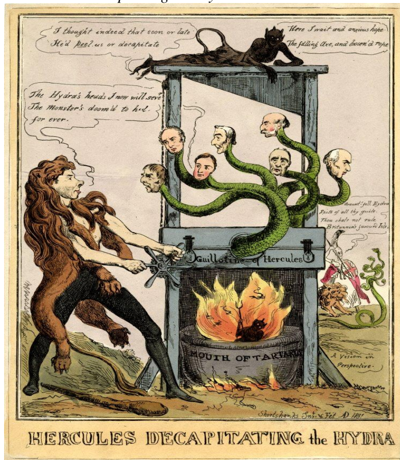
Figure 2. “Hercules Decapitating the Hydra”

Source: Anonymous 1831 Colored etching The British Museum London, United Kingdom