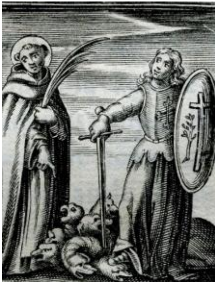
Figure 5. Detail of Arch of the Familiars of the Holy Office of Lisbon: Inquisition Eradicate the Heresies

Source: Jan Schorkens, 1622, Engrave João Baptista Lavanha. Viagem da Catholica Real Magestade del Rey D. Filipe II N.S. ao Reyno de Portugal. Lisboa, 52v.