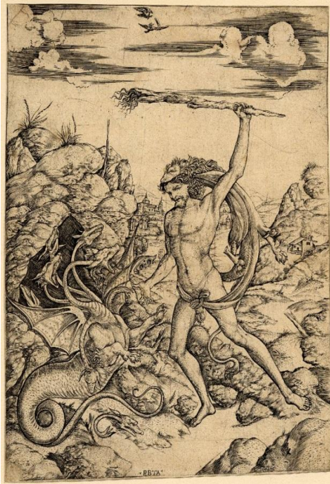
Figure 10. “Hercules Killing the Hydra of Lerna”

Source: After Antonio Pollaiuolo, c. 1500-1520, Engrave The British Museum, London, United Kingdom