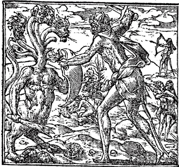
Figure 3. “Honor: The Twelve Labors of Hercules (The Hhydra of Lerna)”

Source: Anonymous, 1558, Engrave M. Andrea Alciato. Toutes les emblems , Lyon, 169.