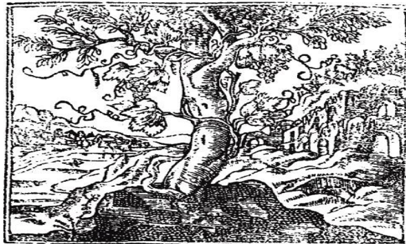
Figure 9. “PRUDENCE: The Prudent avoid the Wine”