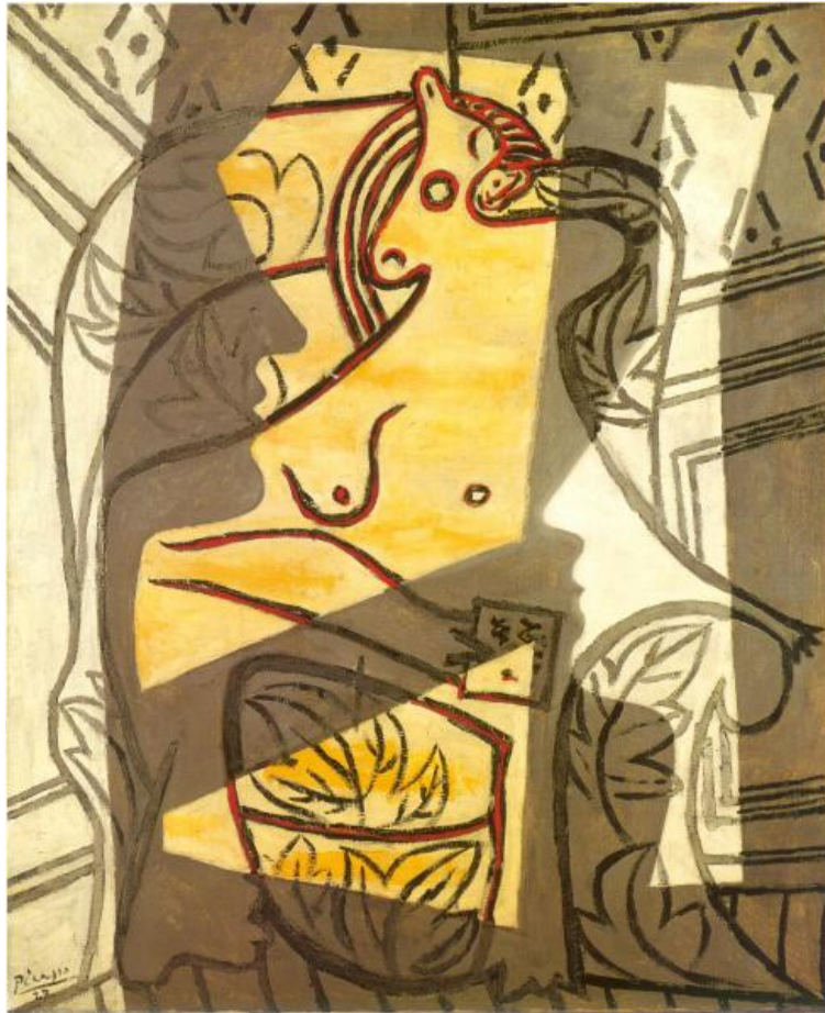
Figure 7. Femme dans un fauteuil. Paris, Spring/1927. Oil on canvas. 71,7 x 59 cm. The Minneapolis Institute of Arts. (Inv 63.2). Gift of Mr. & Mrs. John Cowles, Sr. OPP.27:106

It is interesting to note that Picasso's progressive concentration on the ungraspable Real coincides with the early 1930's, a period which was witnessing the rise of fascism in Europe and the imminent terror of the Spanish Civil War and World War II. There was a feeling of a monstrous presence, like that of the threatening Minotaur (see Fig. 8).