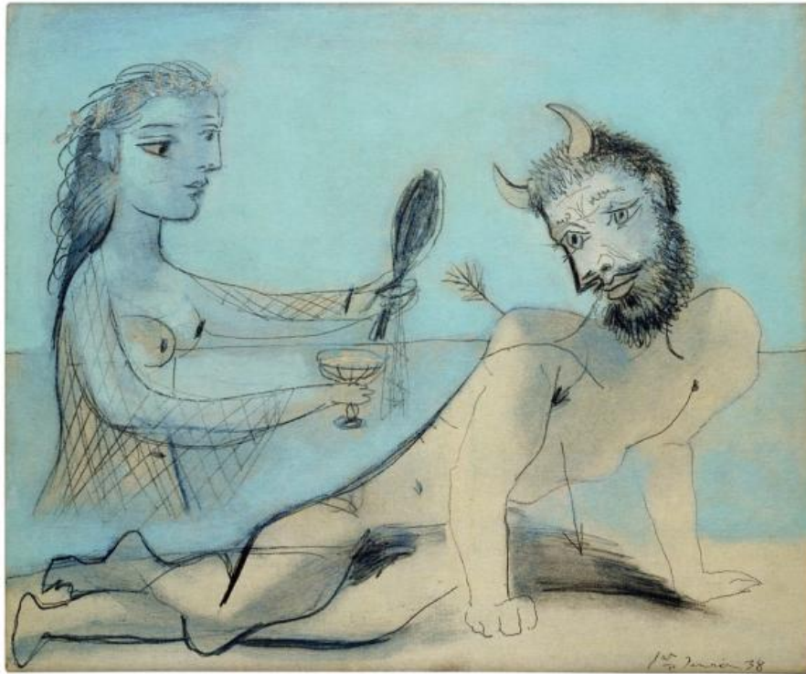
Figure 1. Minotaure blessé et Naiade. Paris. 1-January/1938. Oil and charcoal on canvas. 46 x 55 cm. The Picasso Estate. OPP.38:018

In 1917 Picasso had travelled to Italy with Jean Cocteau, Léonide Massine and Sergei Diaghilev, with whom he was collaborating on Erik Satie's ballet Parade . By this time Picasso had been developing an increasingly Classical style, with a strong influence of Greek and Italian art, an extreme deviation from the Cubism that had formerly dominated his work. As his relationship with the ballerina Olga Koklova began, this Classical style blossomed even further (see Fig. 2). This change had actually been brewing for some time. During the last two years of the Great War, Picasso had moved away from the other Cubists and had decided once again to orient himself toward more representational values, creating works that were deeply indebted to tradition, with an increasing fascination for Jean Auguste Dominique Ingres.