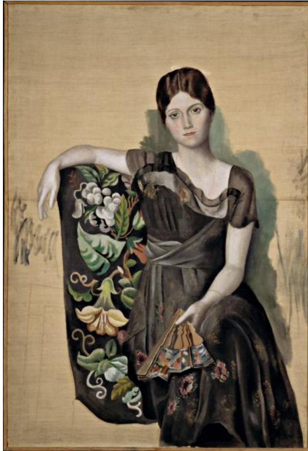
Figure 2. Portrait d'Olga dans un fauteuil. Montrouge. Winter/1917~1918. Oil on canvas. 130 x 88,8 cm. Musée Picasso, Paris. Dation 1979. OPP.17:008

As Cowling asserts, space was now perceived as ambiguous and unstable. The self-sufficient proximity of things, on which Cubism had rung such endless changes, suddenly began to be experienced as airlessness and repetitiveness, mere elegance, a set of tricks and tropes. Objects were reduced to flat tokens. The picture's object-world seemed to vaguely congeal into humanoid ghosts (see Fig. 3). According to Clark, figures in these compositions are merely given weight and identity by being enclosed —by existing in relation to their own finitude. "Being" become "being in." However, this kind of enclosure had to be brought to life in each painting, almost arbitrarily, and doing so could only be managed through structural difference: