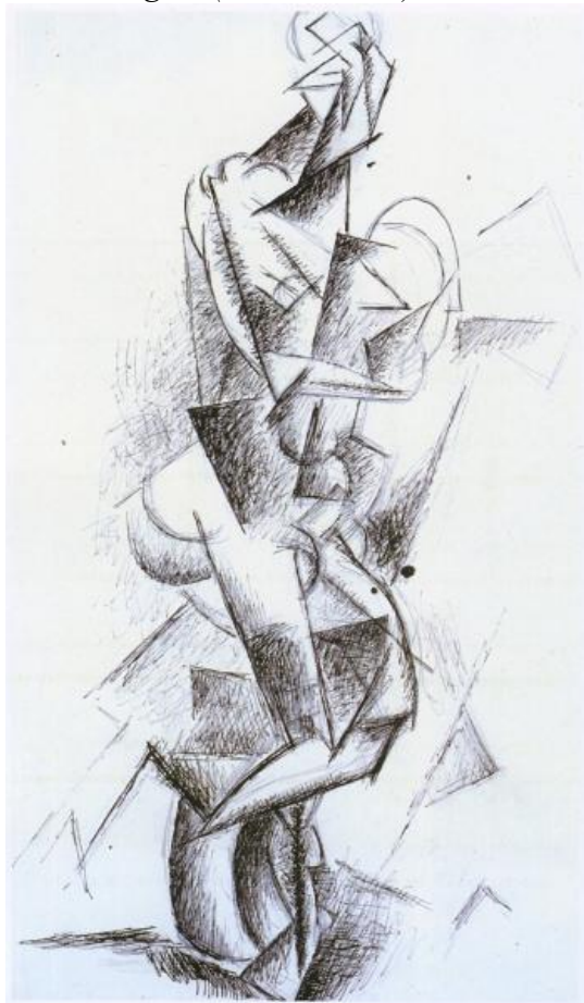
Figure 4. Femme nue. Paris. Spring/1910. Pencil & India ink on paper. 51,5 x 41 cm. Národní Galerie, Prague. (Inv K 33 590). OPP.10:072

In Poggi's opinion, it is the severe restriction in the repertory of formal elements in Picasso's canvases that allowed each unit to take on an astonishing range of values. As Daix argues, the amplitude of signification is due to the fact that the structural configuration makes only the slightest reference to appearances. Reality henceforth is treated as a collection of discrete items of synthesized information which one must rearrange according to independent formal principles. The objects in the composition are constructed in separate planes, whose arrangement in no way relates to any real form, but whose function is to carry meaning by the metaphorical association of categorical features. Picasso's metaphorical play on the possible formal contrasts and analogies between mask/woman and violin/guitar, to give one example, will pervade many of the works from 1912 onwards (see Fig. 5).