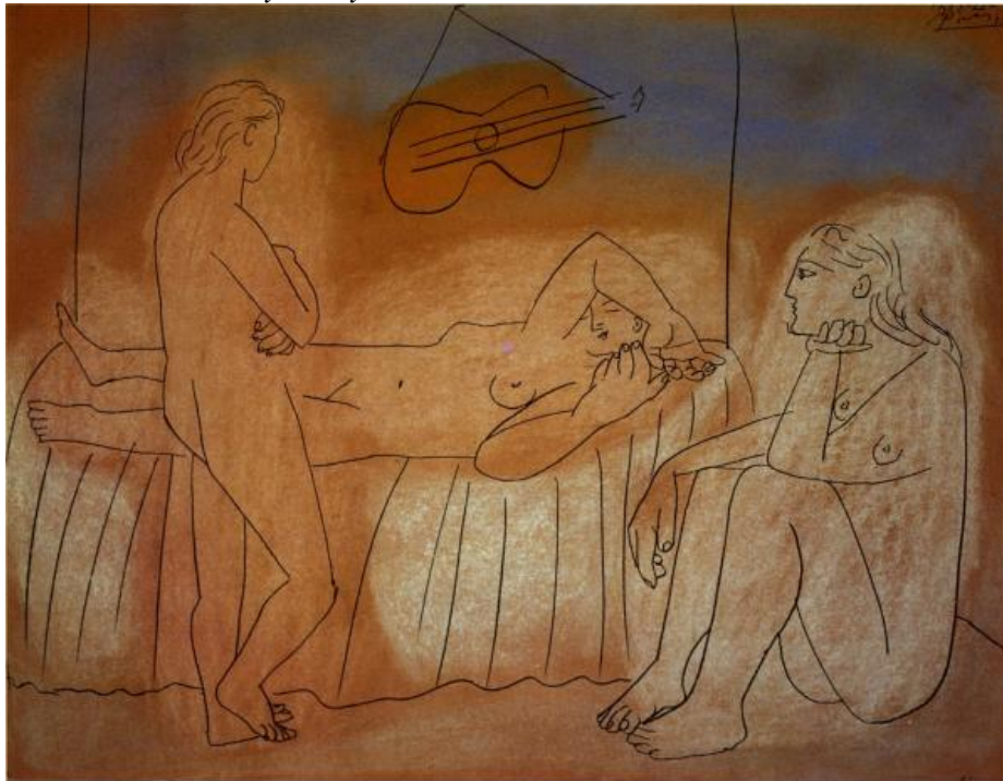
Figure 3. Trois nus féminins. Paris. 12-March/1921. Pastel on paper. 57,5 x 72 cm. Nichido Gallery, Tokyo. OPP.21:073

The important role of the void as a defining feature of objects (human or otherwise) is one of the central tenets of Jacques Lacan’s framework, as Ross explains. Any attempt at understanding or simply thinking of objects in reality is necessarily governed by what he calls the Symbolic order. The entry into the Symbolic makes an intersubjective situation of all signification, as the speaking Subject defines itself in relation to the object it symbolizes; to do so, it must take a position within that Symbolic network—essentially, it must be himself a signifier, in Saussure’s sense. Indeed Lacan designates the Subject as a function of the signifying chain, a linguistic phenomenon produced by the Symbolic which the individual enters in the initial moment of self-articulation. As a result of such a “play of signifiers,” the Subject becomes basically an absence, whose truth is deferred and decoyed by the signifier.