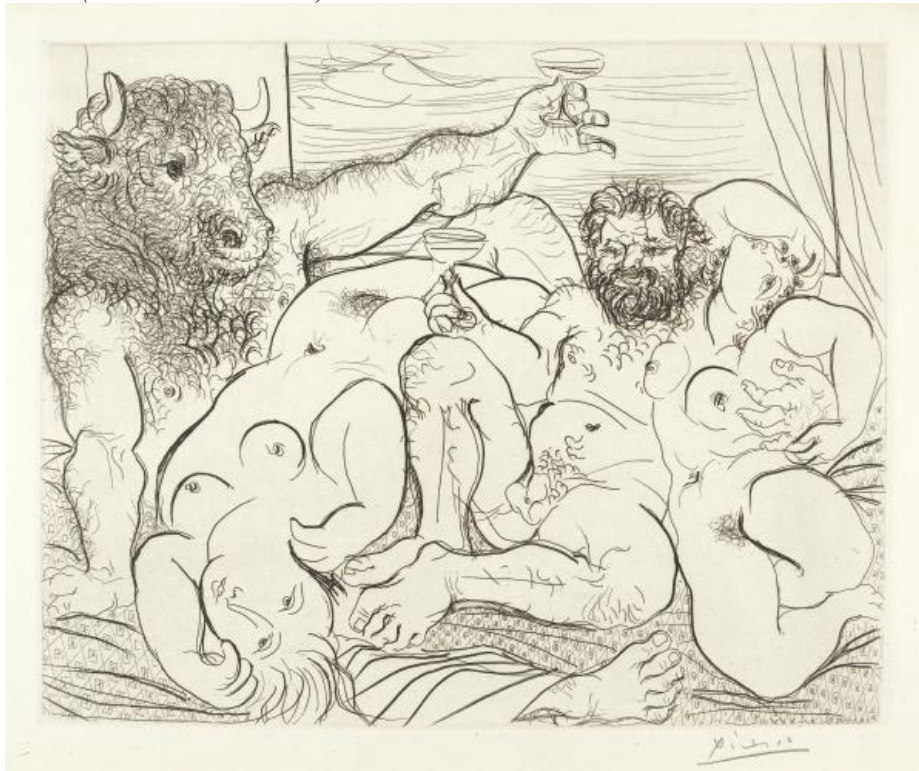
Figure 8. Suite Vollard L059 (III) (Scène bacchique au Minotaure) . Paris. 18-May/1933. Etching on Montval. 29,2 x 36,6 cm. Kunstmuseum Picasso, Münster. (GMP.01.SV.B351). OPP.33:006

The fascination with the Minoan world and the Palace of Knossos (reconstructed by the British archaeologist Arthur Evans in 1928) responds to the need to link up with primitive roots which as yet had not entered a decadent phase. Suddenly pictorial art in Europe found that the pursuit of Truth could no longer be its driving force. As Clark suggests, the nature of the Truth they laid claim to was now so disputed and obscure, so detached from observable experience, that the concept itself seemed a mere rhetorical leftover. Monstrosity moved the picture out of the realm of art and into that of the Real. The task for art —the task for culture— was to shape illusions that would admit monstrosity but keep it in check. The clear outlines that contain the Classical figures in Picasso's works try to do just that. They are the forms illusion must take in the face of chaos: real forms, that is, hard and clear forms, but in the end only enclosures. From time to time the outlines seem to break