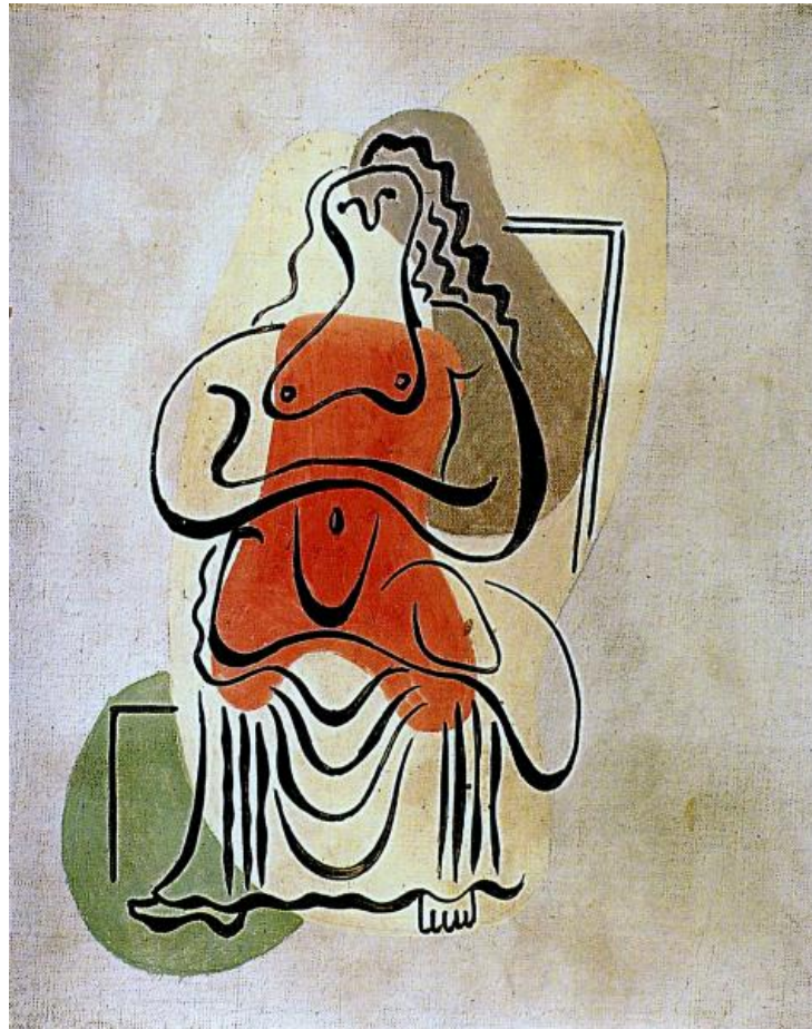
Figure 6. Femme assise. Juan-les-Pins, Summer/1924. Oil on canvas. 24 x 19 cm. The Picasso Estate. OPP.24:049

As Clark explains, shapes and orientations have solidified, and particular objects seem on the verge of coming to life, but they share a feeling less for the specific identities of things than for the conditions of their being together in our field of vision. A process of interlocking and juxtaposition is at work. One gets a sense that objects are most fully themselves for us at their edges, as clear-cut shapes that touch others but also detach themselves to establish their separate identities (see Fig. 6). The artist was wrestling with the problem of how best to state what it is to be an object. Wittgenstein's picture of how the world is constituted seems to move between strong assertions that the world is substantial, and equally strong ones implying that form is what lies at the root of things. The two directions may be ways of expressing the same thing. The problem is to decide which of the two modes of appearance we have been