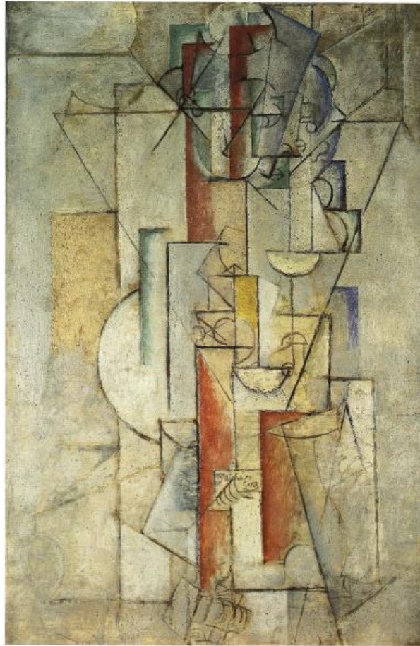
Figure 5. Femme nue ('J'aime Eva') . Paris, [Fall] Winter/1912~1913. Oil and sand on canvas. 75,6 x 66 cm. Columbus Museum of Art, OH. Gift of Ferdinand Howald. OPP.12:027

Following Jakobson, we assume that metaphor is linked to the substitutive axis and metonymy to the combinatorial axis of language. The former can be seen as having a vertical relationship, in which the line between the signifier and the signified is crossed, as the signifier passes over into the signified and a new signifier is produced. The latter involves a horizontal movement along the chain of signification, as one signifier constantly refers to another in a perpetual deferral of meaning. Metaphor is a process of substitution, whereby one signifier comes to stand in for another in relation to a given signified, while metonymy is a movement above the barrier separating signifier from signified. More specifically, metaphor is the direct substitution of one signifier for another such that the second signifier supersedes the first in relation to the signified. In Lacan's theory, this process is the basic structure of identification as it occurs in a second order which he labels the Imaginary. While the signifier is the foundation of the Symbolic, the signified and signification are part of the Imaginary.