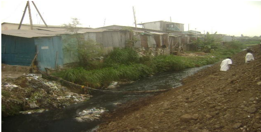
Figure 2. Lunga-Lunga Slums in Nairobi (Some Buildings within Riparian Reserve)

Formal planning in Kenya have failed to address the problems of such areas that bear the greatest consequences since they fall in areas that are not supposed to be occupied by human settlements, the municipal governments turn a blind eye to such areas or respond through forced eviction which are sporadic and do not offer alternatives. Thus slum dwellers in LungaLunga, Kibera, Mathare among others in Nairobi, Ziwa la Ng’omber and Moroto in Mombasa, Kondele in Kisumu and Langas in Eldoret continue to suffer the consequences of flooding that have been exacerbated by climate change. Unfortunately, the slum dwellers lack the resources and the capacity to respond in a timely manner to the floods or to adapt or to move to less vulnerable areas. Urban governance has also failed to incorporate or engage them in finding lasting solution and often reacts with feigned surprise whenever floods claim properties and life in these settlements (Opiyo, 2009).