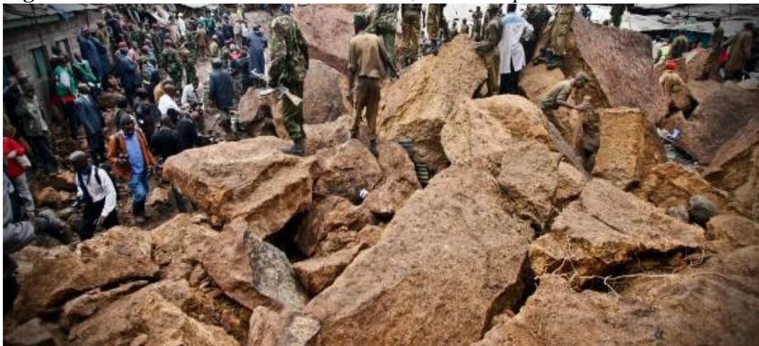
Figure 3 and 4. Landslide in Mathare Slums, Nairobi April 2012

The risk from landslides brought about by heavy and sporadic rainfall due to changes in climate is also likely to increase as urban development continues on marginal and dangerous lands (UN-Habitat, 2011). With rapid urbanization, populations, especially the urban poor, increasingly settle in areas that are prone to hazardous landslides and are unsuited for residential development (Awuor, et al, 2008; Kebede, et al, 2009). In Kenya, this has already been felt with the latest incidence of landslide in Mathare Valley slums in Nairobi in April 4th 2012 where heavy down pour led to a landslide that claimed six lives and rendered many homeless (See Figure3 and 4). These people have settled in a valley greatly exposed to the dangers of landslides, but lack an alternative due to poverty. The urban government in their plan failed to anticipate this despite the chronic shortage of housing in Nairobi City. Official records merely show this as a disused land while thousands consider this as their home. According to Smyth and Royle (2000), chronic poverty, urban land speculation, insecure tenure, inadequate urban infrastructure investment, and poor urban planning policies contribute to continued development in vulnerable areas.