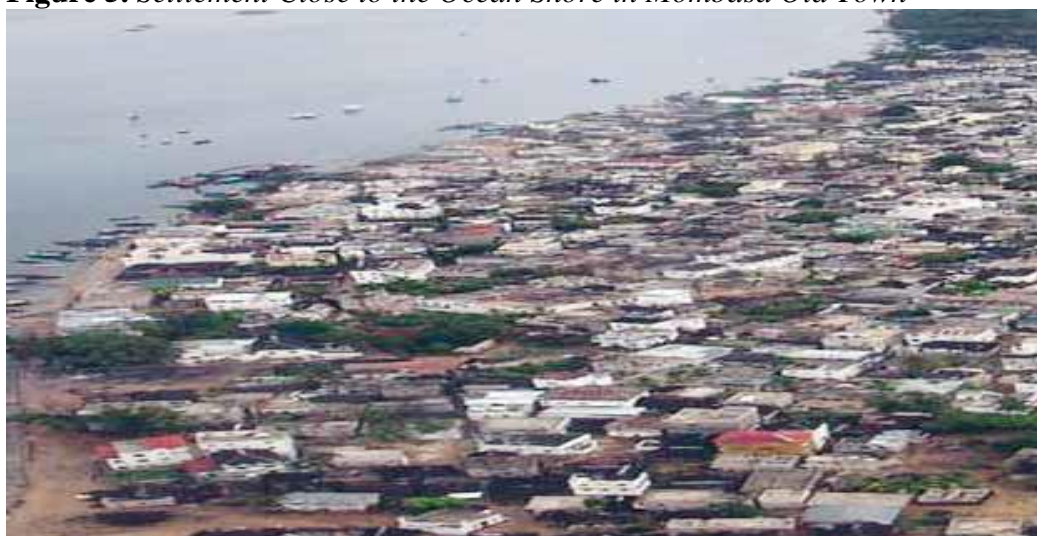
Figure 5. Settlement Close to the Ocean Shore in Mombasa Old Town

Mombasa's area could be submerged by a sea-level rise of 0.3 metres, with a larger area rendered uninhabitable or unusable for agriculture because of water logging and salt stress. Among other potential impacts of sea level rise in the coastal towns are rising water levels and storm surges that can cause massive flooding leading to property damage, displacement of residents, disruption of transportation and wetland loss (UN-Habitat, 2010). The increased vulnerability of Mombasa residents particularly the poor to these impacts is the location of their residents in very low lying areas close to ocean (see Figure 5). Thus, urban planners in coastal towns of Kenya such as Mombasa, Malindi and Kilifi have to take this into consideration.