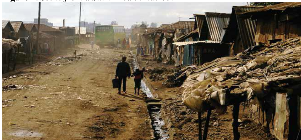
Location of Some Cities in Low Altitudes

Mombasa, the second largest city in Kenya, the largest seaport in East Africa and a popular tourist destination lies between the sea level and about 45 metres above seal (Kebede, Hanson, Nicholls and Mokrech, 2009). This places it at a high risk of submergence in the event of sea level rise. Given that it is estimated that during the 20th Century, sea level has been rising at a rate of about two millimetres per year (Bondoff et al, 2007), it is estimated that about 17% of Mombasa will be submerged with a sea level rise of only 0.3 meters (Mahongo, 2006). Kisumu town, another city in Kenya is located at the shores of the large expanse of Lake Victoria, exposing it as well to dangers of being swept away in case of unprecedented increase in the lake levels. Such locations put at risks these major towns in Kenya. Despite these obvious dangers that may take place due to climate change, very little have been done especially in terms of planning to prepare for such eventualities.