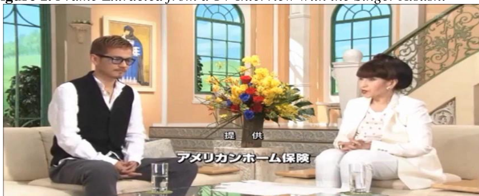
Figure 1. Frame Extracted from a TV Interview with the Singer Atsushi

Before analysing the role of feedback in this excerpt, it is necessary to underline the asymmetrical character of the dialogue, which exceeds the normal limit between interviewer and interviewee and can probably be explained with the fame of the singer and with the equal fame and older age of the host. This is why the guest assumes a deferential attitude, which clearly shows through his body posture (rigid pose with hands crossed), through his tendency to keep his face lowered, avoiding eye contact with the interlocutor