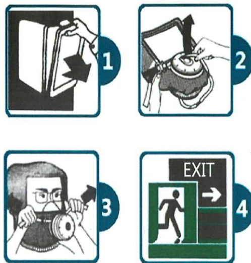
Figure 2. Manufacturer Donning Pictograms