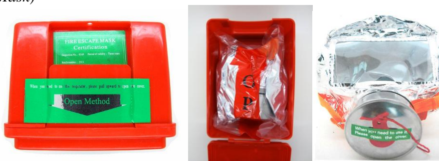
Figure 1. KIKAR XHZLC 60 Fire Escape Mask (Package, Vacuum Sealed Bag, Mask)

Others have suggested the times to don smoke hoods are considerably lower than the \leq 30 seconds specified in the ASTM & ANSI standards. The University of Greenwich, Fire Safety Engineering Group (FSEG) offers a number of ‘Fire Safety Tips’ including some for smoke hood selection and use. Professor Ed Galea, Galea (2014) states that the smoke hood should “Be easy to put on and have clear instructions for proper use. Owners should aim to be able to don the smoke hood correctly in around 10 seconds (as measured from