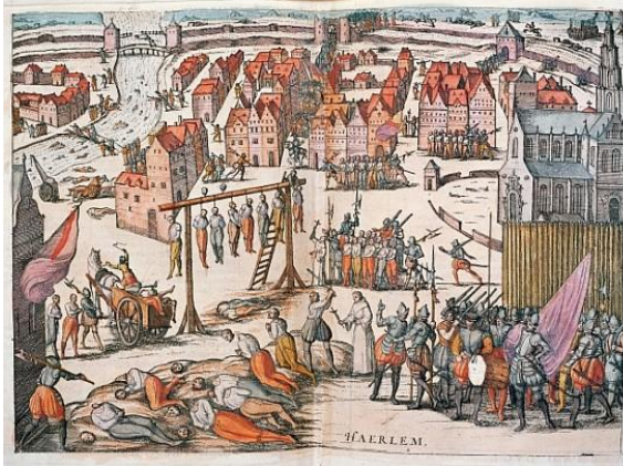
Figure 3. Spanish Soldiers Killing Protestants in Haarlem, 2nd of 16th C., Colour Engraving, Private Collection

In Europe, torturing people as a form (method) of execution has continued for ages. For example, breeking wheel was used in France, in Germany and Prussia up to early nineteenth century. In England criminals were hanged, drawn & quartered at this time; public hangings continued into the nineteenth century.