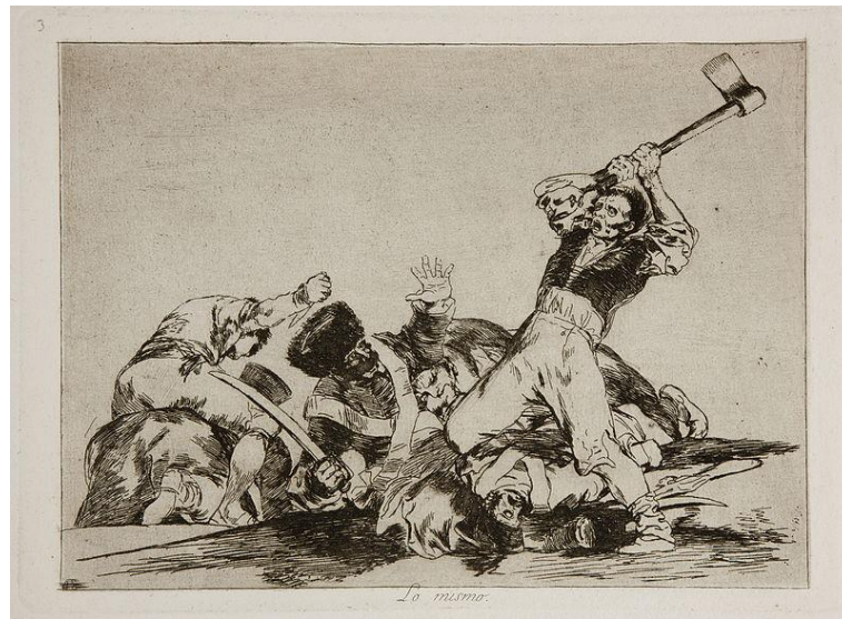
Figure 8. Francisco Goya, (The same), 1815, Engraving, 16 x 22,1 cm., Prado Museum, Madrid

Three prisoners ... What is common in these three paintings is that they are nameless, random, depictions of bodies. Goya not only deeply empathized with the victims but also made sure that the pain in the paintings is transferred to the audience.