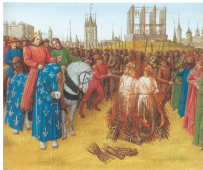
Figure 1. Burning of Amalricians, 15th. C., Illuminated Manuscript, Bibliothèque Nationale, Paris

For example the Amalricians, a heretical sect that emerged around the end of the twelfth century, sentenced to death by being burnt alive before Philip Augustus the King of France (1165-1223).