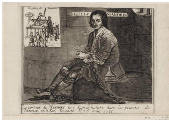
Figure 4. Louis Mandrin in Prison, 18th C., Engraving, Bibliothèque Nationale, Paris

Michel Foucault’s book of Discipline and Punish horrifically relates Damiens’ execution scene who unsuccessfully attempted to assassinate Louis the fifteenth King of France in 1757. Damiens was taken to the Grève Plaza and his arms and legs were torn out by hot pliers while he was on the gallows. The