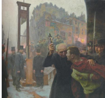
Figure 10. Émile Friant, The Capital Punishment, 1908, Oil on Canvas, 166 x 167,6 cm., Art Galery of Hamilton, Ontario-Canada

In Emile Friant's painting what is important that the condemned looking at Christ on the cross through the crucifix, while being taken to the guillotine representing that both of them are victims- the son of God and the condemned , the son of man himself. 1