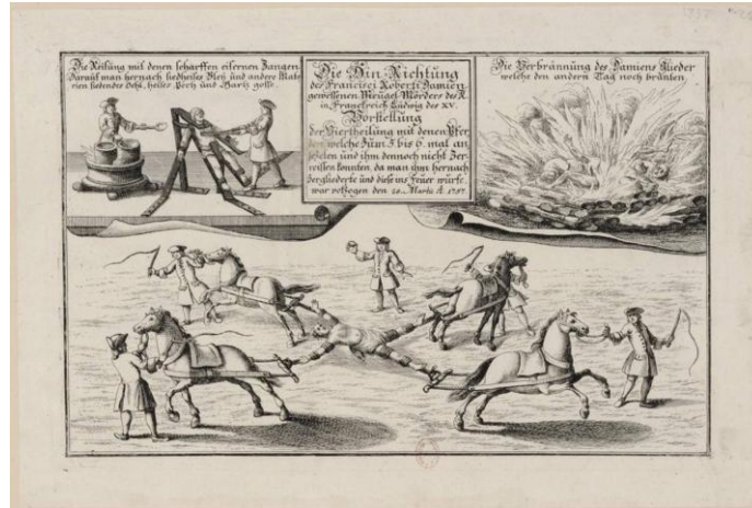
Figure 5. Robert François Damiens, 18th C., Engraving, Bibliothèque Nationale, Paris

However at the end of the eighteenth century and beginning of nineteenth century we see the practice of torturing the body; despite all arguments is almost extinct. This practice being no longer valid, the modern judicial system, the politically and morally new regulations in the criminal justice act have established important social changes.