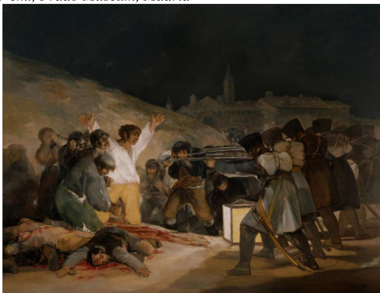
Figure 6. Francisco Goya, The Thirth of May 1808,1814, Oil on Canvas, 268 x 347 cm., Prado Museum, Madrid

The victim in a white shirt who is about to be killed with his arms wide open dominates the dramatic structure of the painting. Still there is neither fear of death nor rage on his face and he is ready to die. This composition with dying people, the darkness of the night and the light of the lantern makes us feel the destructive force of violence. In contrast to the particularly vivid detailed depiction of the victims, the portraiture of the perpetrators is in the form of a geometrical firing line. Their faces are hidden, their guns are in a horizontal position and they are represented as mechanical killing machines. 4 Maybe Andre Malraux's commentary on the painting is the most accurate one.