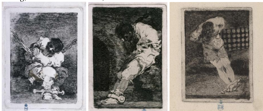
Figure 9. Francisco Goya, c. 1815, Francisco Goya, 1859, Francisco Goya, 1859, 11 x 8,5 cm., Engraving, 11 x 8,5 cm., Engraving, 11 x 8,5 cm., Engraving, Biblioteca Nacional, Madrid

Emile Friant (1863-1932) The French naturalistic painter who is against death penalty, painted The Capital Punishment in 1908 carries a special meaning. It was just about the time when the abolition of the death penalty was being discussed thoroughly. Although the socialist government in power was in favour of the abolition of this punishment act, they mostly came out against it when it was a matter of rape or homicide.