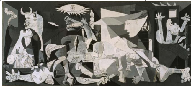
Figure 11. Pablo Picasso, Guernica, 1937, Oil on Canvas, Newspaper Print, Postage Stamps, 349,3 x 776,6 cm., Museo Reina Sofia, Madrid

There are no obvious perpetrators in the painting; nor do the bombers or bombs appear in the composition. Technology not only changed the means of warfare but also the relationship between perpetrators and victims. The battlefield is constituted in the implied sound of the victims' wails and their grief. 2