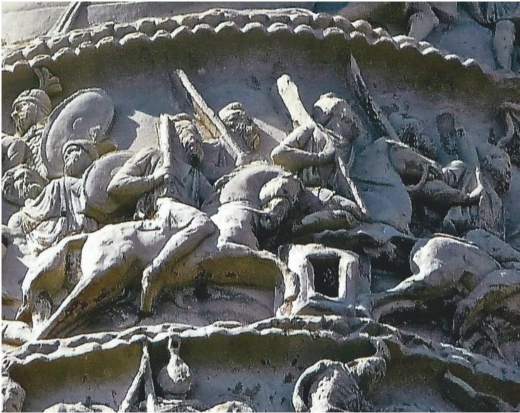
Figure 9. Cavalryman (Left Center) on the Column of Marcus Aurelius Holding Upright (Top Broken) What Appears to Be Another Example of A "Battle Truncheon"

Column. 1 Such a weapon can be modified to the user's whim, so it should not be surprising to find sophisticated versions of more lethal clubs in the forms of these "Battle Truncheons"— in this case, in the hands of Pompilius and his lieutenant. 2