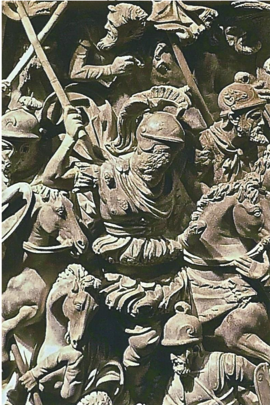
Figures 5. Similarly Sculpted General's Cloaks (Paludamentum) of Pompilius (figure 5) and Marcus Aurelius (figure 6)