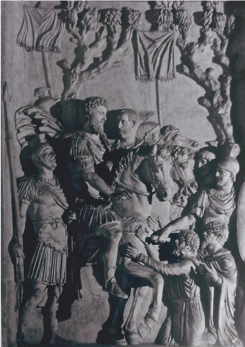
Palazzo dei Conservatori (Capitoline Museums, Rome).