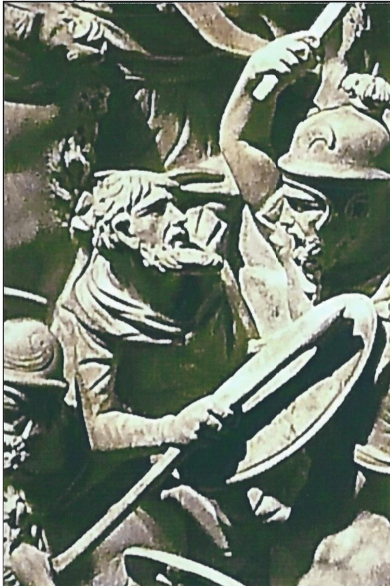
Figure 8. German Opponent with Conventional War Club in Hand

The “Battle Truncheons” that Pompilius and his lieutenant wield, however, appear to have a handgrip, indicated by the fact that Pompilius holds his at its base with his index finger opened over the top edge of it for a tighter grasp. 1 If there were no grip there, his fingers would be closed all together like those of his fellow horsemen who hold lances. In fact, no one can hold a lance or a sword in the way Pompilius holds his Truncheon-- nor could his lieutenant hold any other type weapon but a Truncheon with his hand positioned in the backward manner it is and still be able to strike downward on an enemy’s head.