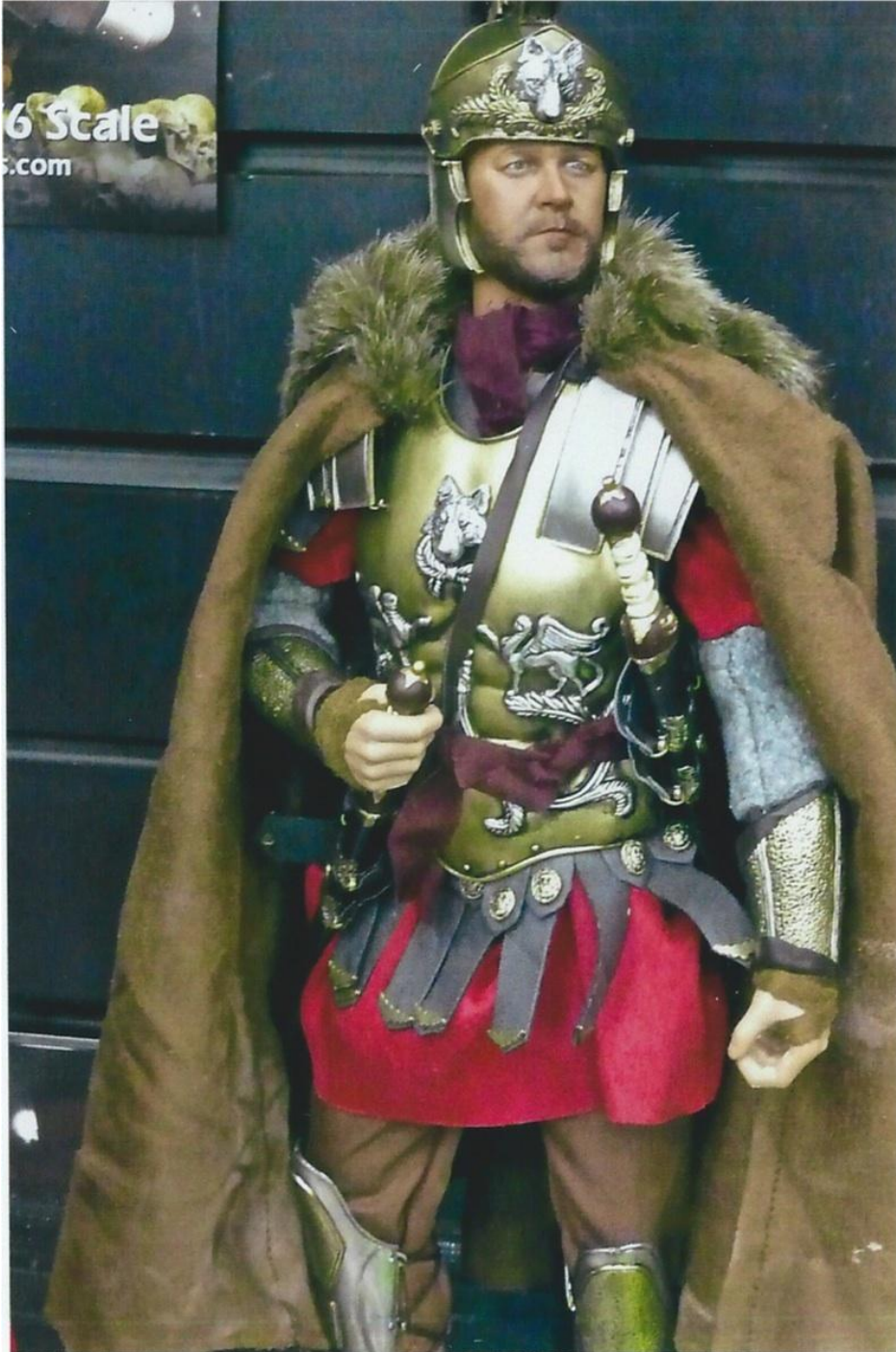
Figure 1a. Scale Model Representation of Maximus with His “Dog” Emblazoned Armor in Gladiator

This certainly would not seem to be the ideal situation into which to introduce one's favorite dog, apparently so dear to Maximus that its image graced both the general's helmet and cuirass (figure 1). In fact, if one compares the perilous film action to the portrayal of an actual engagement of Marcus Aurelius' cavalry against the Germans on the Portonaccio Sarcophagus at