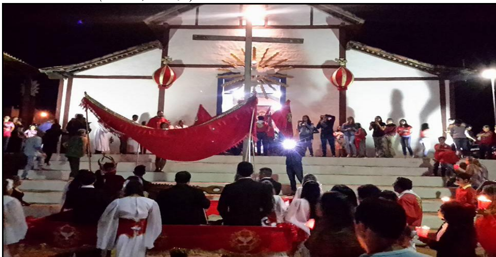
Figure 3. Representation of the Empire's Court of the Divino Espírito Santo, in Pilar de Goiás (Goiás, Brazil)