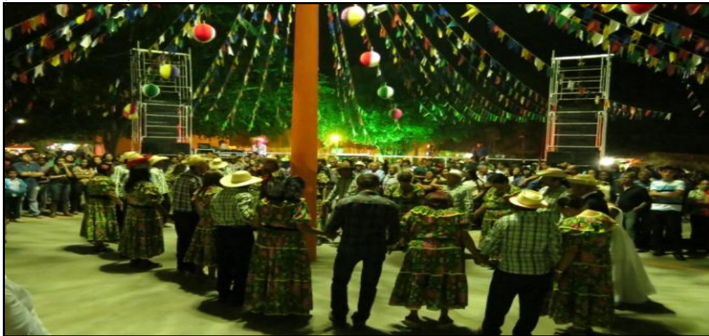
Figure 7. Quadrilha of Third Age in the Arraiá do Descoberto, in Porangatu (Goiás, Brazil)