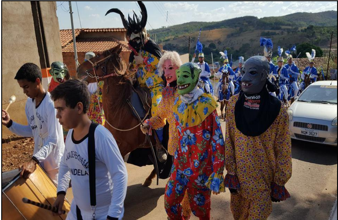
Figure 4. Masked and Knights in the Direction of the Cavalhadas field, in Pilar de Goiás (Goiás, Brazil)