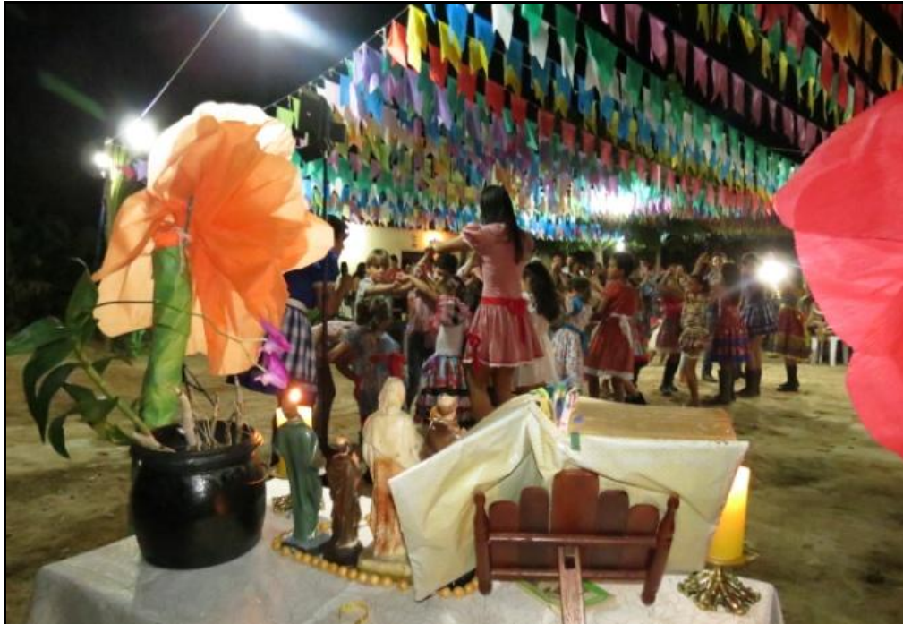
Figure 6. Altar to Santo Antônio, São João e São Pedro, Quadrilha 38 in the Arraiá da Boa Vizinhança, in Porangatu (Goiás, Brazil)