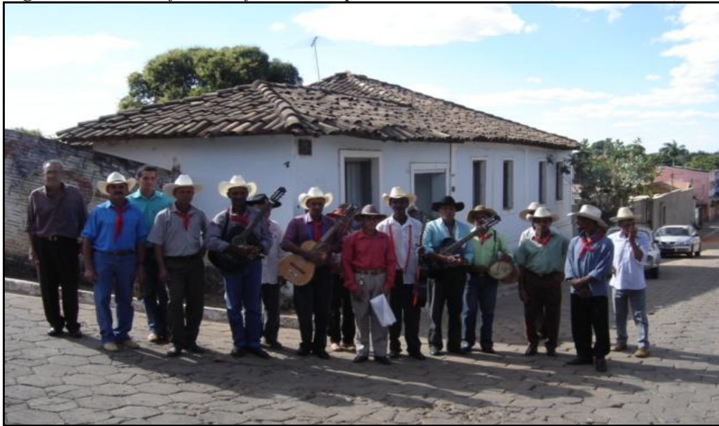
Figure 2. Circuit of Folia of Divino Espírito Santo, in Crixás (Goiás, Brazil)

Often, personal devotions become motives of the great gatherings of people. Finally, the festivities enter in the religious calendar and become part of everyday urban life. Families take turns in devotions to their own divinities and commitments to keep family traditions alive. There are various festivities that constitute an intangible heritage in these cities. For now, we present only a few more significant traditions, which put the population of cities in contact with the space of material heritage.