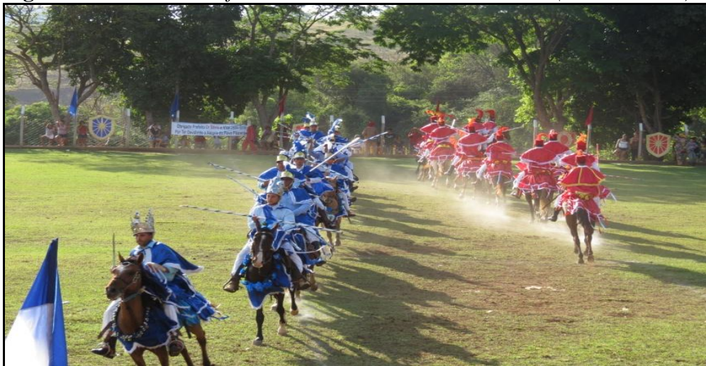
Figure 5. Presentation of the Cavalhadas, in Pilar de Goiás (Goiás, Brazil)