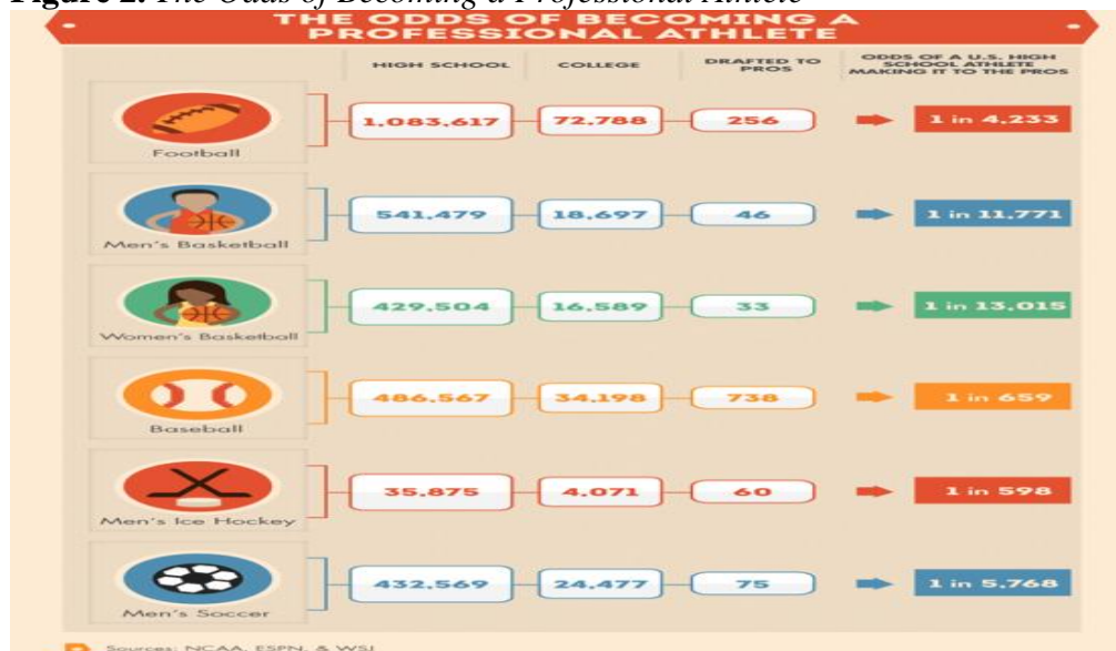
Figure 2. The Odds of Becoming a Professional Athlete

2006). In Figure 2 the probability of one realizing the aspiration to become a professional athlete within a variety of disciplines is provided (Kerr-Dineen 2016).