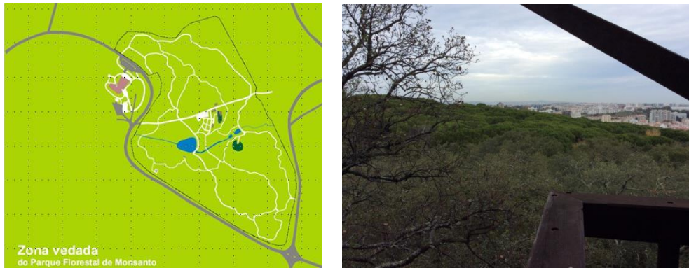
Figure 3. On the Left, the Map of the Biodiversity Space, a Small Area inside the Monsanto Forest Park. On the Right, a View of the Space from the Observation Tower