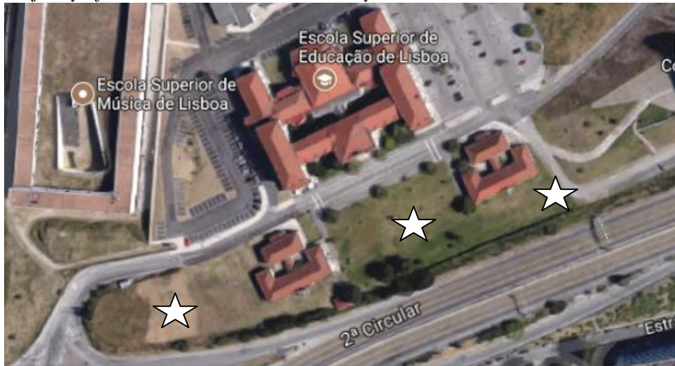
Figure 4. The Localization of the Planting Action in the Campus of the IPL. The Majority of the Plants were distributed by the Areas with a Star