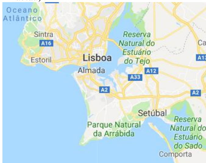
Figure 1. Localization of the Nature Park of Sintra-Cascais (Parque Natural Sintra-Cascais) and of the Nature Park of Arrábida (Parque Natural da Arrábida)

Contact with nature is an important dimension of the training of any student, independently of his/her age or cycle of schooling. As Kola - Olusanya (2005) points out, in natural places students can learn in a more integrated and contextualized way, and learn to respect Nature, also understanding the threats caused by human action, but also the positive actions taken for its preservation.