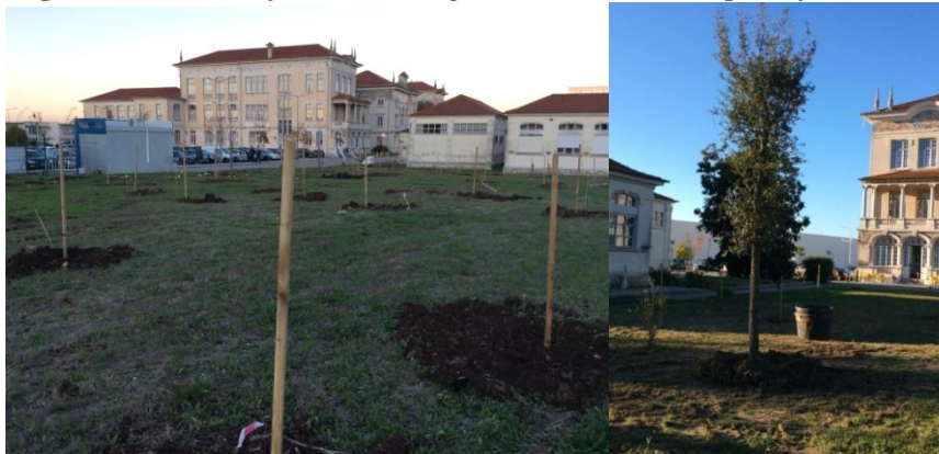
Figure 5. Photos of the Planting Action in the Campus of the IPL

Thus, about 100 trees and 100 shrubs from different species were planted (see the species on Table 2). The plantation involved a group of students and obeyed to a previous planning for the distribution of the species for the intended space. A range of activities has been carried out using sensors to analyze noise levels, carbon dioxide levels and temperature measurements. Thus, plantation sites were chosen as the result of these measurements and also from the need to improve the aesthetics of the area, leading to its greater fruition for leisure and learning purposes.