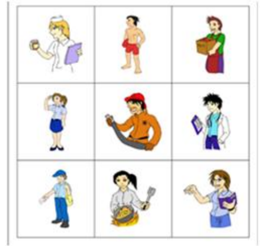
Figure 1. Activity Implemented during Lesson Plan 3, Experimental Group

Another proof of this situation might be found in the way concepts are presented in the culture; especially the social characteristics, which are evaluated through previous agreements that later become formalized signs. As observed in Figure 1 below, a behavioral indicative features selection to denote profession by employing the military salutation that guides the observer to understand a rank of authority without a representamen , the stethoscope being widely known as a tool to be used by medical personnel as well as a nurse's cap - originally designed for identification of the woman in service of the sick population - has become an irrefutable interpretant . The fragment strongly advises that the student first identified the previous cultural elements to then relate them with the representamen applying an omission principle in order to select the most probable (or appropriate?) option.