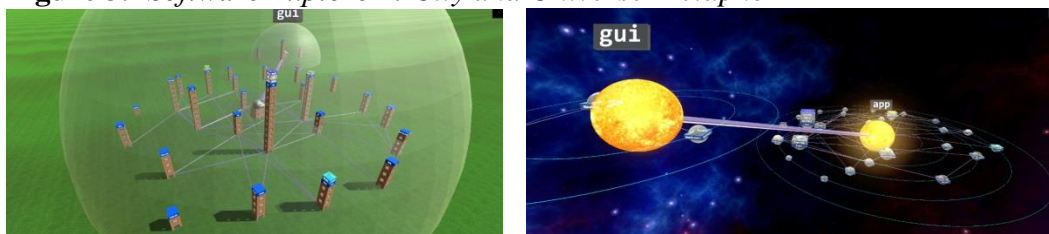
Figure 3. ‘Software Explorer’: City and Universe Metaphor

We have performed evaluations with our students. They had to do some tasks (searching for the biggest class, connections ...). The appearance of both metaphors – city and universe – is offered in different order. The students could move in a certain section in the real room. The exploration in the virtual world could be done by going within the bounds (these are visible in the VR world and correspond to the bounds in the real world), by moving the head and by using the controller.