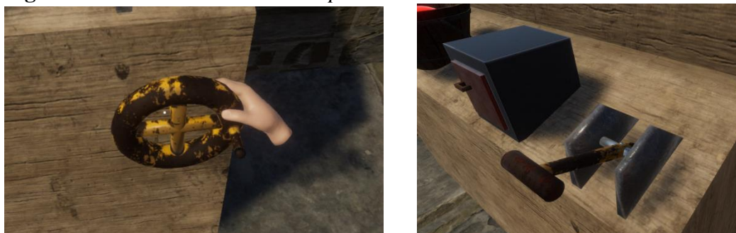
Figure 2. VR Interactions in a Computer Game

In the project ‘Software Explorer’, the transition from non-VR to VR was well received by the students. However, in evaluation sessions of the project, some students had to interrupt their tasks because of indications of motion sickness (dizziness, headache, slight nausea).