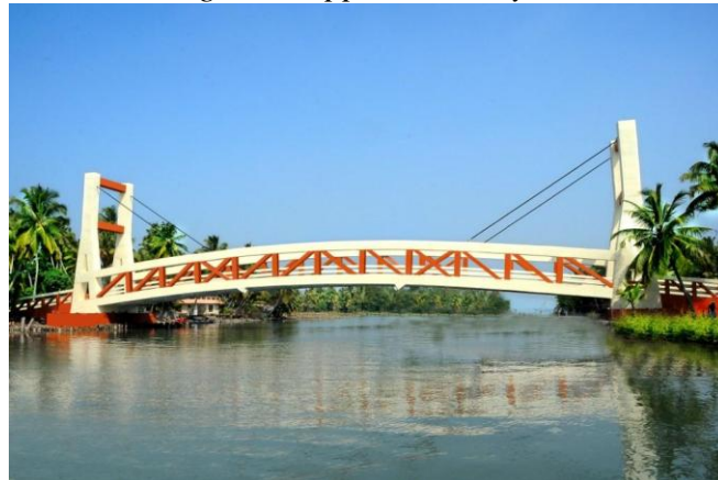
Figure 1. Edathuruthu Bridge in Alappad Panchayath

Alappad Panchayath of Kollam District in Kerala came to be known to the World after the devastating Tsunami waves hit the West Coast of India on 26 th of December 2004. Loss of 145 lives during the devastation of the Tsunami was attributed mainly to the absence of Bridges across TS Canal providing escape routes to secure places. Edathuruthu is an isolated Island in the Alappad Panchayath of Kollam District. Around hundred families are living on this Island. Before the construction of bridge there existed only private ferry service, which is inadequate for the movement of the people for their day to day needs. Hence construction of a bridge at this location is very essential for the safety of the inhabitants. Local self Government Department of Kerala decided to construct a bridge to provide accessibility to the inhabitants of the Edathuruthu Island under the special package of Tsunami Rehabilitation Programme and the work was entrusted to Kerala Public Works Department. Because of various administrative constraints, work was carried out Departmentally. Fig.1 shows the Edathuruthu Bridge which was completed and opened for traffic in February 2013.