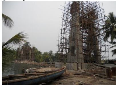
Figure 4. Shuttering System for Pylon

The pylon is modeled as frame element. Due to non prismatic shape of the sections, a fully supported scaffolding system was chosen for concrete pouring on the 16m high pylon (Fig.4). Due to heavy reinforcement in the pylon's section, particularly at the proximity of the stay cable anchors, special care was given to the reinforcement work and effectiveness of concrete compaction.