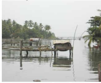
Figure 2. Location of the Bridge

On the basis of the soil investigation report, design for the bridge was prepared by M/s Sree Giri Consultant, Kochi. The truss was anchored to the pylon at two points to minimize the bending moment in the trussed arches and the trussed arches also used as hand rails. Anchors are prestressed before deshuttering to minimize the dead load deflection. The bridge is designed for IRC Class A Loading and the design is done by satisfying all relevant IRC specifications. Fig.3 shows the structural model of the bridge.