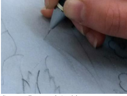
Figure 16. Detail of Piercing Design on Parchment