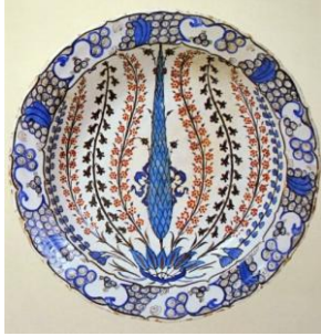
Figure 4. Iznik Plate 16 th Century

In this type of compositions; the pattern is designed on one side of a vertical line dividing the pattern in the exact middle, called the middle axis (Figures 4-5). Then the paper is folded over the middle axis and the designed composition is copied on the opposite side to obtain a symmetrical pattern. Thus, composition integrity is ensured. However, in this style of compositions generally the symmetry is broken by making some changes, especially in size, in some motifs at the bottom part of the plate or some other parts.