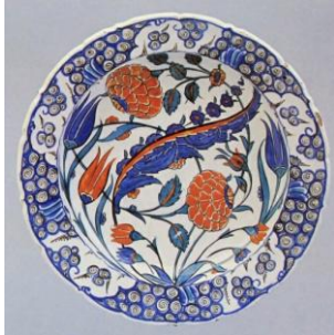
Figure 7. Iznik Plate 16 th Century