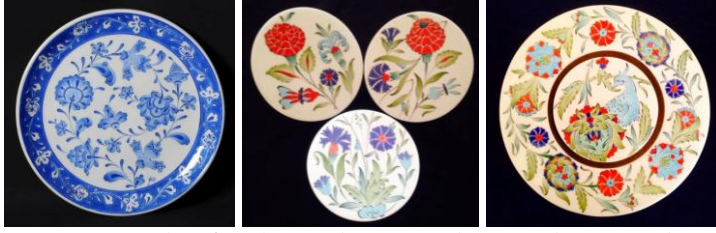
Figure 28, 29, 30. Decorated and Glazed Ceramics