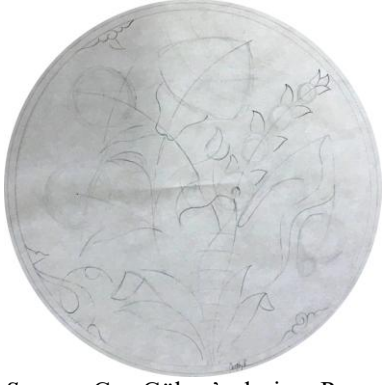
Figure 12. Preparing Composition for Plate on Parchment Paper