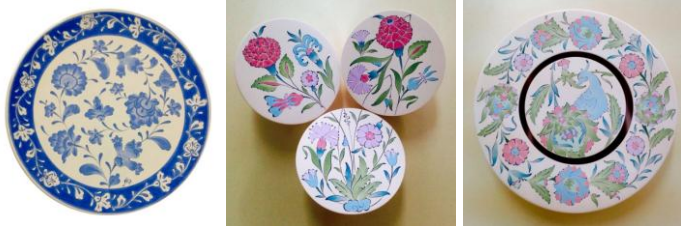
Figures 25, 26, 27. Decorated Ceramics (Berfore Glaze Firing)