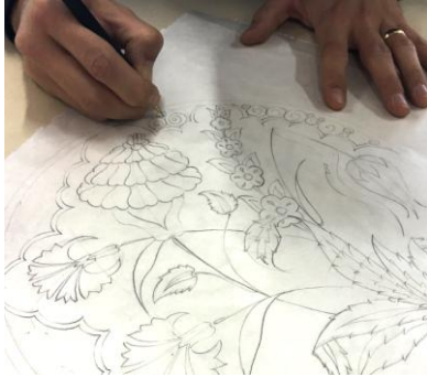
Figure 14. Detailing The Composition for Plate on Parchment Paper