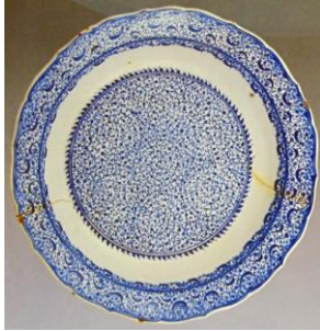
Figure 10. Iznik Plate 16 th Century

This type of composition includes multiple arrangements. Each unit oriented around certain axes are again tied together in orientation to certain axes. In this arrangement each unit is linked to another in orientation to certain axes in order to form a whole (Figures 10-11).