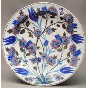
Figure 6. Iznik Plate 16 th Century

type (Figures 6-7). It is widely used in motif arrangements featuring plants. The most beautiful samples of this composition type are seen in the 16 th century classical patterns.