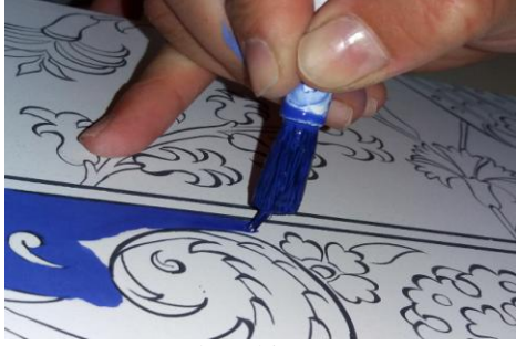
Figure 24. Using Horsehair Brush