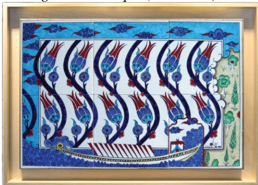
Figures 33, 34. Can Gökçe's Artworks, Decorated with Classical Underglaze Technique (40x60 cm)