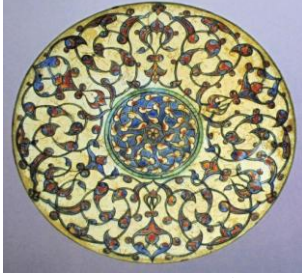
Figure 9. Iznik Plate 16 th Century