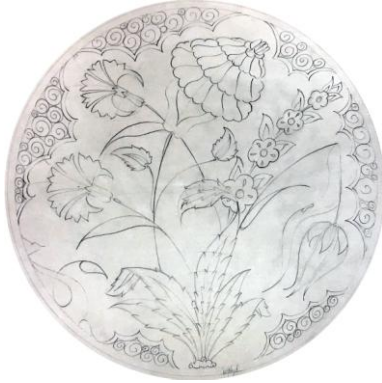
Figure 13. Detailed Composition for Plate on Parchment Paper