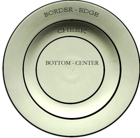
Figure 3. Plate Parts, Border-Edge, Cheek, Bottom-Center

generally are connected with each other in a different location and direction. The different patterns and motifs are applied to the surfaces like body, neck, cheek, bottom in specific styles and measures at the given concentration.