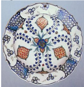
Figure 8. Iznik Plate 16 th Century

This type of composition is also called centrally developed composition. In this type of composition, the motifs forming the composition are all oriented to the centre (Figures 8-9).