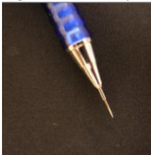
Figure 15. Detail of Pencil with Needle

Source: Can Gökçe's design, Personal Archive.