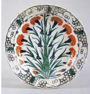
Figure 5. Iznik Plate 16 th Century