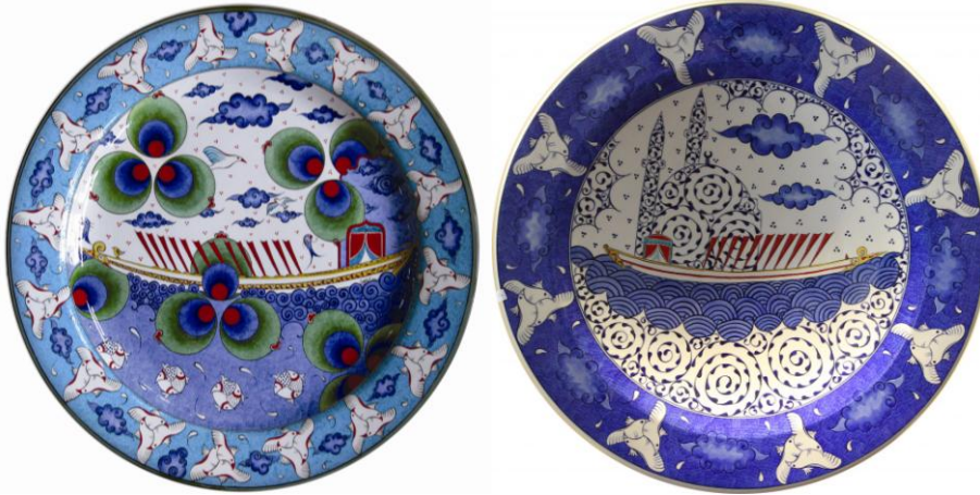
Figures 31, 32. Can Gökçe's 18 Artworks, Decorated with Classical Underglaze Technique (Ø: 82cm)

Today the ceramic glaze is adjusted according to the texture. Cracks and texture-glaze incompatibility can be seen especially due to some raw materials and substances used in Kütahya from time to time. The glaze used in these in a low degree transparent glaze with alkali-lead content. Glazing temperature varies between 930 and 1050 °C.