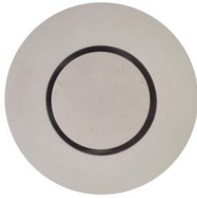
Figure 17. Sandpapered Biscuit Fired Form