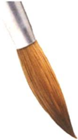
Figure 18. Sable Brush

The drawn pattern is perforated by pins, generally by placing a bead pin in a mechanical pencil (Figures 15-16), and transferred to the form by using coal dust. The biscuit fired form must be firstly ground with fine sandpaper to obtain a smooth surface to ensure that the brush moves freely (Figure 17). The pattern transferred to the form by the coal dust can also be drawn in by a brush, but beginners may prefer to lightly draw over the pattern by a pencil. In ceramics the contour lines surrounding the motifs are drawn in black or blue, using a brush. This is called "tahrir." In the ceramics of Iznik essaying is performed with sable brushes (Figure 18). Generally number 3 sable brushes are used for this purpose, but number 2 and 4 brushes are also used for drawing outlines of motifs (Figures 19-20-21). Drawn outlines-contours include nuanced lining (thin-thick). Then motif painting stage begins.