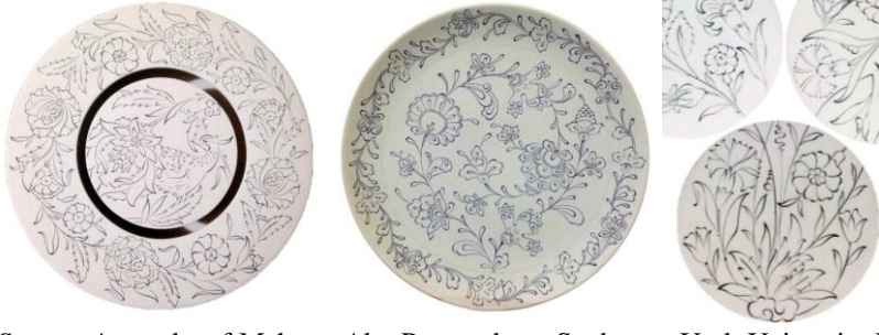
Figures 19, 20, 21. Drawn Contours of Motifs