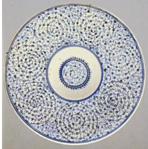
Figure 11. Iznik Plate 16 th Century