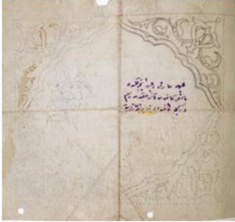
Figure 2. Pierced Paper Stencil (Gar0 Kürkman Collection)