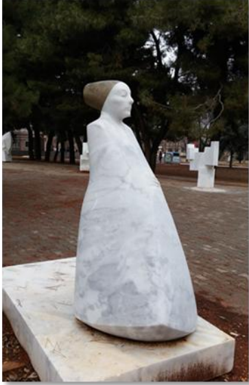
Figure 9. Khaled Zaki, Sufi Marble , Gaziantep, 2014

Egyptian artist Khaled Zaki who is interested in Sufism ideas and Mevlevi beliefs, depicts the plain posture of a Sufi with different materials in his sculptures. As a significant sculptures sculptures today, Zaki displayed success with his work called The Sufi . stylizes the postures of Sufis in his works prefers to use simple lines in his forms. One of his sculptures in this theme is the marble sculpture created at Gaziantep University's 1 st International Stone Sculpture Symposium. Another similar form made of bronze was displayed in 55 th Venice Biennial in 2013.