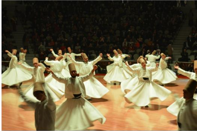
Figure 2. An image from the Whirling Ceremony

Whirling, which is a way of worshipping for a Sufi to show his love for Allah, is of Arabic origin and means to hear, to listen. 1 "The meaning of the word Whirling in other words hearing can be described as to meet requirements of what is heard. Whirling dervishes hear universal realities during Whirling ceremony and then, they try to behave as required" (Menteş, 2011: 26). This ritual, which has been performed since the period of Hz. Master, was organized with established rules were established by the founders and followers of the order although there were not any regulations stipulated by Mevlana.