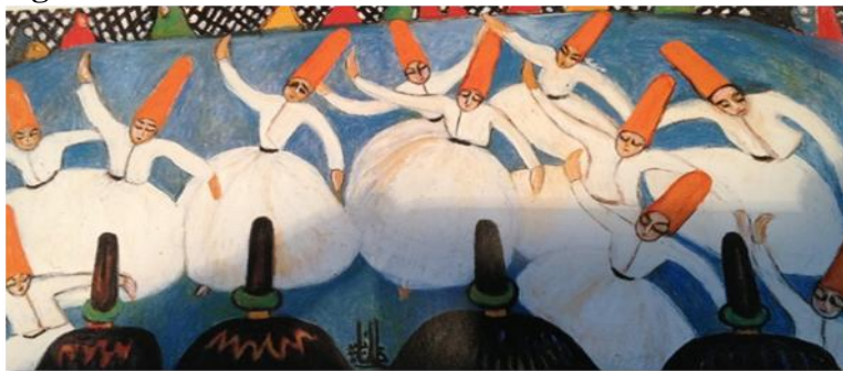
Figure 8. Fahrelnissa Zeid, Dance , 1980

Artist Fahrelnisa Zeid who has an important place in Turkish art history, is among the artists inspired by Whirling. In her painting called Dance , which she created in 1980, in the foreground is Mutrib Heyeti, which is the musician group in ceremonies; they are seen from their backs. The middle part of the painting shows stylized whirling dervishes and figures watching the ceremony in the background. The artist depicted a classical whirling scene on canvas by her own style and using rich and vivid colors.