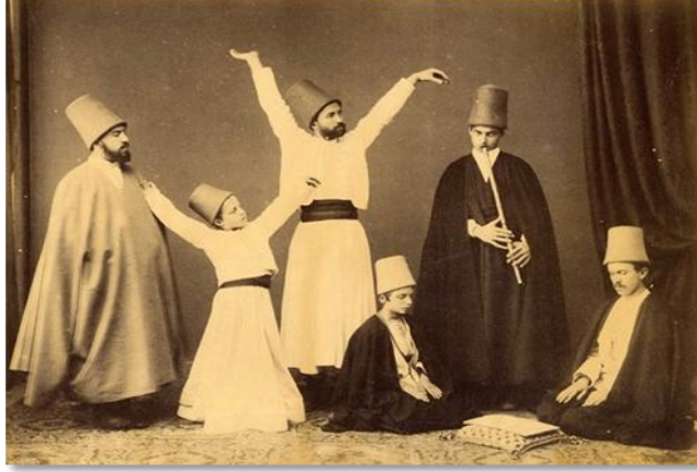
Figure 1. An image from Mevlevi lodge

Whirling, which is a way of worshipping for a Sufi to show his love for Allah, is of Arabic origin and means to hear, to listen. 1 "The meaning of the word Whirling in other words hearing can be described as to meet requirements of what is heard. Whirling dervishes hear universal realities during Whirling ceremony and then, they try to behave as required" (Menteş, 2011: 26). This ritual, which has been performed since the period of Hz. Master, was organized with established rules were established by the founders and followers of the order although there were not any regulations stipulated by Mevlana.