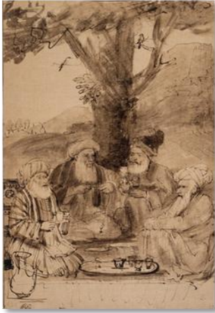
Figure 3. Rembrandt, Four Dervishes