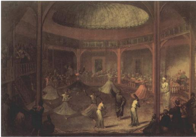
Figure 4. Jean –Baptiste van Mour, Mevlevi Dervishes in Pera