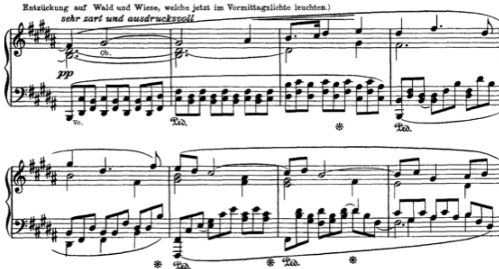
Figure 2. Good Friday Music

Friedrich Oberkogler described the Good Friday music as growing organically out of the main motivic materials of the work as a whole, so that it would seem to originate from them and yet contain them all at the same time, symbolic of the redemption that comes to man and nature alike during the passage. 1