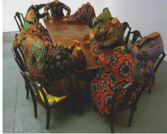
Figure 6. Title of figure Yinka Sonibare, Yinka Shonibare MBE, Scramble for Africa , 2003. Fourteen figures, fourteen chairs, table, Dutch wax printed cotton textile, 52 x 192 x 110 inches overall. Commissioned by the Museum for African Art, New York. Collection of Alden Pinnell. Courtesy of the artist and Stephen Friedman Gallery, London

Reference: String Felt Thread, the Hierarchy of Art and Craft in American Art, Elissa Auther, University of Minnesota Press, Minneapolis, London p.170