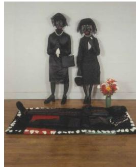
Figure 4. Faith Ringgold, "Ìkiyüz The wake and Ressurrection of the Bicentennial Negro", Life- sized soft sculptures Bena and Buba, 70 x 36 x 4 inches; Moma and Nana, 67 x 40 x 16 inches. Flag Pad, 70 x 36 x 2 inches; flowers, 18 x 22 x 12 inches. Collection of the Studio Museum in Harlem.

Reference: String Felt Thread, the Hierarchy of Art and Craft in American Art, Elissa Auther, University of Minnesota Press, Minneapolis, London p.112