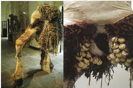
Figure 8. Gemma Smith, Headless Woman , 2001., 190x155x120 cm

Reference: Scott J., 2003, Textile Perspectives in Mixed-Media Sculpture, The Crowood Press LTD, S. 160, Ramsbury, England, p. 90-91