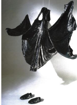
Figure 7. Jac Scott, 'Echo of the lost souls', 2001. Materials; plaster, cotton cloth, acrylic paint. Dimensions: 153 x 145 x 95cm

Reference: Scott J., 2003, Textile Perspectives in Mixed-Media Sculpture, The Crowood Press LTD, S. 160, Ramsbury, England, p.47