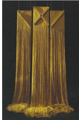
Figure 2. Claire Zeisler, "Untitled" , 1967, Jute, Denver Art Museum, USA

Reference: Auther E., 2010, String Felt Thread, The Hierarchy of Art and Craft in American Art, University of Minnesota Press, p. 249, Minneapolis, London, p. 24