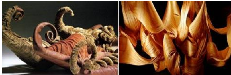
Figure 11. Suhandan Ozay Demirkan, (Turkish fiber artist), Anatolian Fiber Shoes

http://v3.arkitera.com/news.php?action=displayNewsItem&ID=16772 , 03.08.2012