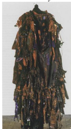
Figure 5. Harmony Hammond, Presence V, 1972. Cloth and acrylic, 78 x 28 x 18 inches. Art copyright Harmony Hammond. Licensed by VAGA, New York, New York

Reference: String Felt Thread, the Hierarchy of Art and Craft in American Art, Elissa Auther, University of Minnesota Press, Minneapolis, London p.137