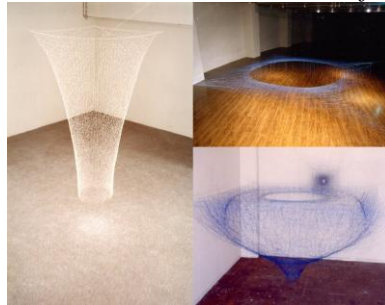
Figure 10. Akiko Ikeuchi, "silk vortices". Although they seem chaotic with regard to complex installations, each work of Akiko has a plan. Hurricanes, whirlpools, and galaxies: the works are reminiscent of nature's great forces

https://www.facebook.com/photo.php?fbid=483363468356061&set=a.351980568161019.105695.337671456258597&type=1&theater , 27.06.2012