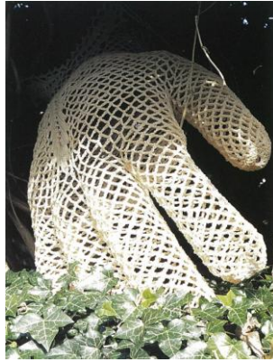
Figure 9. Nicola Morriss, "Glove", 120x58x35 cm

Reference: Scott J., 2003, Textile Perspectives in Mixed-Media Sculpture, The Crowood Press LTD, P. 160, Ramsbury, England, p.98