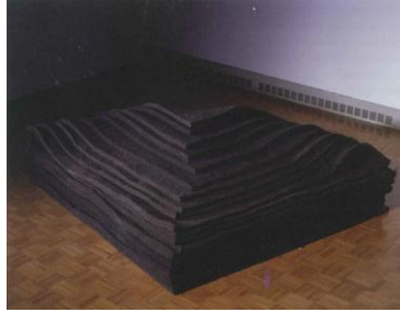
Figure 3. Robert Morris, 1967-70, "Untitled", different sizes gray felt, Williams Collage Art Museum, (the gift of Leo Castelli) New York