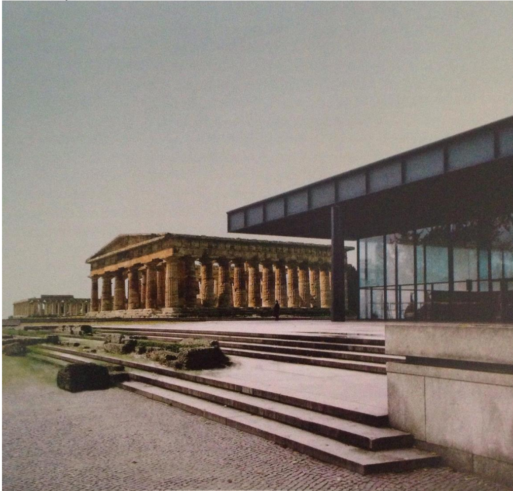
Figure 1. Photomontage “La piana dei templi” where it can be seen the National Gallery of Mies Van der Rohe, the Ruins of Nettuno’s Temple, and the Basilica of Pestum