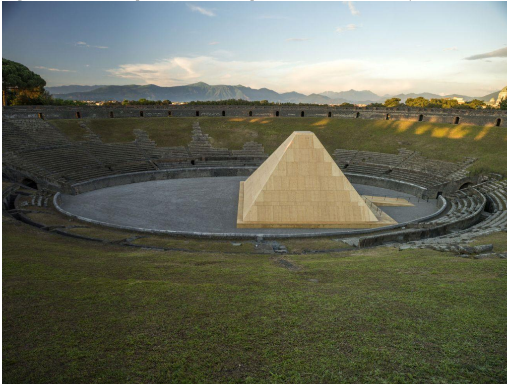
Figure 3. Roman Amphitheater in Pompeii with the Venezia's Pyramid