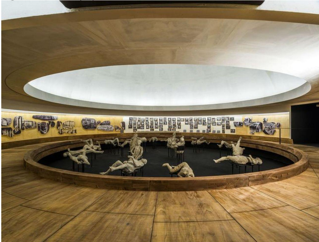
Figure 4. Interior of Pyramid with Casts