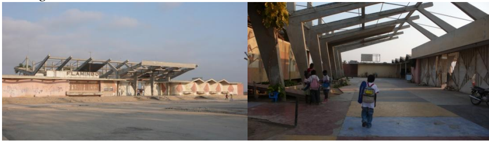
Figure 15. Flamingo Cine-esplanade, Lobito, Angola. (1963) Francisco Castro Rodrigues

One of the most paradigmatic examples are the open-air movie theatres, the so-called cine-esplanadas . 26 If the movie theatre symbolically embodied the idea of progress, the architecture of such spaces affirmed its consciousness: the cine-esplanada is cinematographic in itself. Its spatial structures make us experience an “architectural promenade” with long cinema “travellings.” These are large-sized buildings, intended for a mass public and seeking a monumental scale like Cine Flamingo in Lobito (Figure 15) and Cine Miramar in Luanda. Their symbolic nature defines them as strategic landmarks in the urban context. The main concern that is common to all these projects is the structural design of the roof or projected roof platform aimed at giving it an expressive form, or else, the significance given to the size and plasticity of the screen. Such plasticity, as well as the textures and color combinations used are a clear reference to the “free form modern” developed by Brazilian architects in the 1940s and 1950s or by Le Corbusier’s late works.