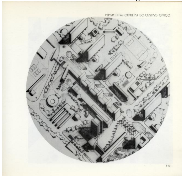
Figure 1. Vasco Vieira da Costa – “Luanda Sathelite Plan n° 3.” 1948. Civic Center Center Detail and Housing Units

mosquito from passing over it. As it seems of necessity, under a health and social point of view, native populations should form various scattered groups that will embrace as small satellites the European hub, and so each sector of this hub will be served by a native group. In this way, we will shorten the distance to be covered between workplace and residence.” 12 It should be noted, however, that this hierarchical social organization model is based perhaps more on Le Corbusier’s 1922 “Ville Contemporaine” project than on the Athens Charter postulates, in which the city was already thought for a “classless” society.