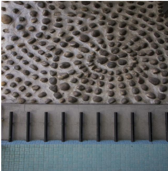
Figure 5. Abreu, Santos e Rocha Building, Maputo, Mozambique (1953)-Pancho Miranda Guedes. Detail.