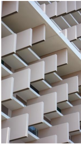
Figure 3. Maristas School, Beira, Mozambique (1959)- Francisco José de Castro. Detail Brise-soleil