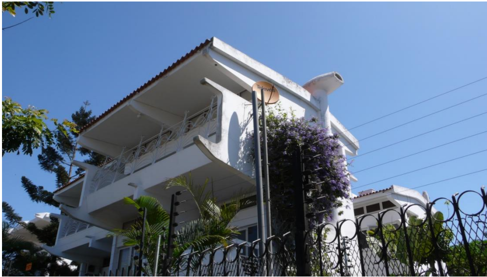
Figure 11. Matos Ribeiro House, Maputo, Mozambique (1952). Pancho Miranda Guedes