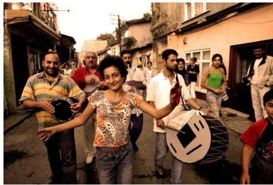
Figure 8. The Sulukule Urban Regeneration Project. Fatih Municipality and Housing Administration of Turkey (TOKI).