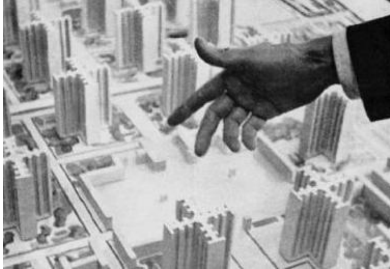
Figure 6. Model of Le Corbusier's Plan Voisin. Le Corbusier, 1964.

Subsequently, we can envision the architect as a practitioner of 'architectural praxis,' who 'attempts to re-define both the role of designer and the content of the object of architecture in a larger social context,' as underlined by Güven Arif Sargin (2010, p.25). When architecture is reconsidered as a form of praxis, the definition of the designer can be transformed 'from creator to producer, from individual and subjective to the interacting social agent' (Sargin, 2010, p.25). Within this framework, the architect becomes responsible to act as a 'social agent' cultivated with a vigorous civic interest assuming an active responsibility in shaping of the built environment.