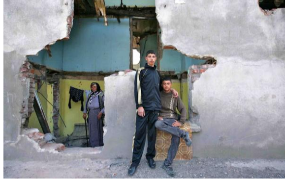
Figure 7. The Sulukule Urban Regeneration Project. Fatih Municipality and Housing Administration of Turkey (TOKI). http://www.elephantsociety.com/sulukule.html ; http://sulukulegunlugu.blogspot.com.tr/