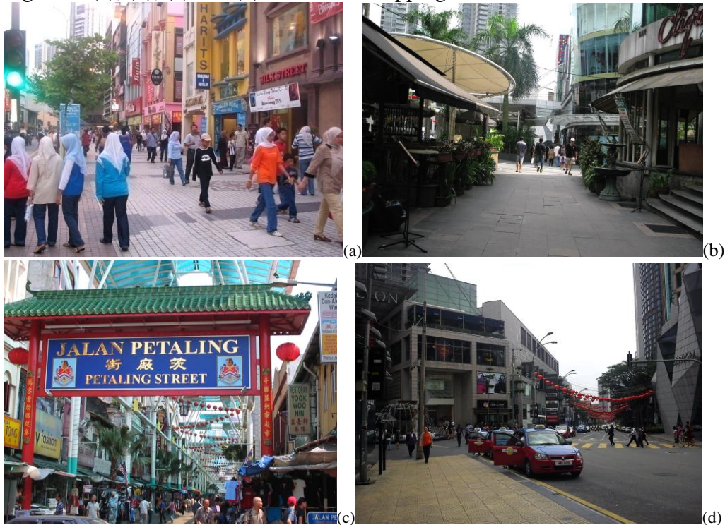
Figure 2 (a), (b), (c) and (d). Views of Shopping Streets

It is found that the visitors have a positive response when asked about whether they have a pleasant walking in the area. The pleasantness is mainly associated with experiencing the expression of culture. However, one of the respondents mentioned that he could feel the pleasantness only when the sunshine is not too strong. It is also claimed that there is a very limited number of parks in the city centre that they can feel relax but the opposite feeling can be strongly felt in the city centre due to the intensity of traffic. The Kuala Lumpur City Centre Park is thought to be very nice and cooling except one who responded that the place is not attractive visually. But the walking is enjoyable due to the presence of buildings in the area. A lot of trees and bridges, as well as fountains, give a relaxing feeling. Respondents also associated the pleasantness with the shopping activities and the sights and sound of the places with its multi-cultural diversity. Figure 3 present the typical street scenes streets in the city centre of Kuala Lumpur.