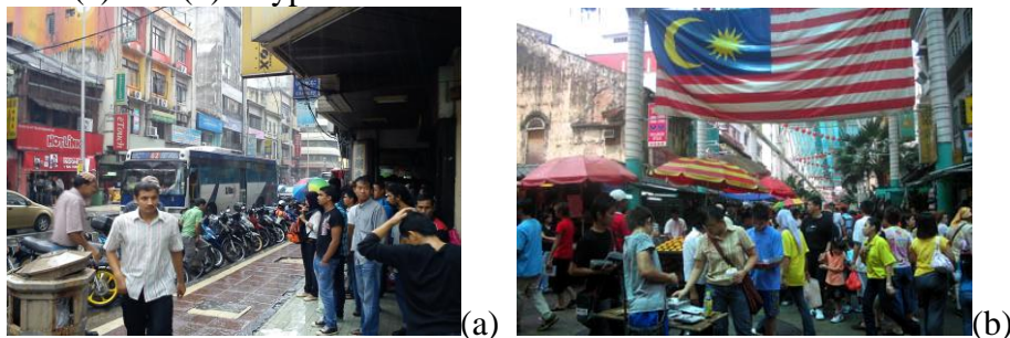
Figure 3 (a) and (b) . Typical Street Scenes

It is found that the visitors have a positive response when asked about whether they have a pleasant walking in the area. The pleasantness is mainly associated with experiencing the expression of culture. However, one of the respondents mentioned that he could feel the pleasantness only when the sunshine is not too strong. It is also claimed that there is a very limited number of parks in the city centre that they can feel relax but the opposite feeling can be strongly felt in the city centre due to the intensity of traffic. The Kuala Lumpur City Centre Park is thought to be very nice and cooling except one who responded that the place is not attractive visually. But the walking is enjoyable due to the presence of buildings in the area. A lot of trees and bridges, as well as fountains, give a relaxing feeling. Respondents also associated the pleasantness with the shopping activities and the sights and sound of the places with its multi-cultural diversity. Figure 3 present the typical street scenes streets in the city centre of Kuala Lumpur.