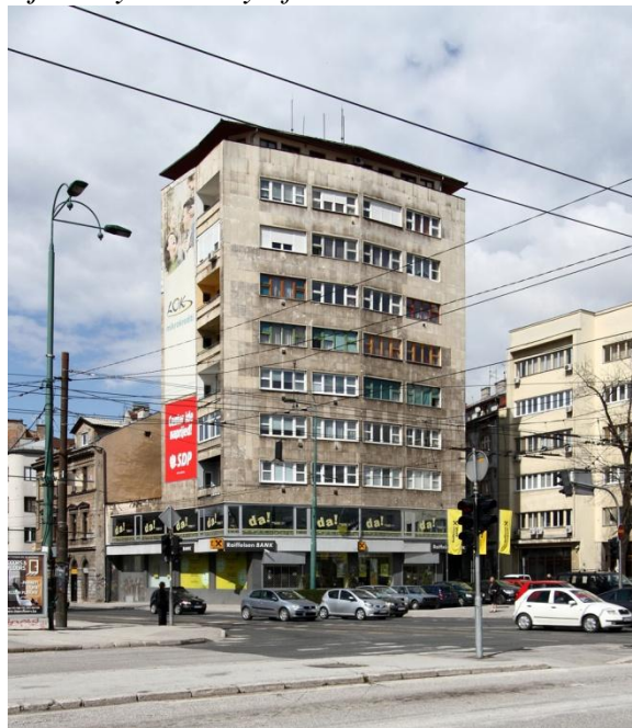
Figure 2. Private Interventions on Existing Apartment Building "Rapid" Skyscraper in Sarajevo by courtesy of © Anida Krečo

sources: http://www.a4a.info/ArticleView.asp?article_id=949 by courtesy of © Anida Krečo