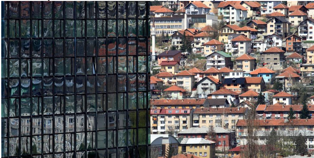
Figure 5. Neo-liberal De-urbanisation of Sarajevo ("UNIS" tower on the left and urban sprawl on the hills on the right)

of these residential units will be legalized (Al Jazeera, 2013). The state is not able to implement development plan, the predominance of the private property over the state is such that private investors take full control over the construction of the building within their private property. All this leads to the territorial division of the state to the individual property over which the state has no control. It is the spatial manifestation of the collapse of the post war Bosnian society which was previously discussed. In a word: it is a process of neo-liberal de-urbanization of Bosnia and Herzegovina (Figure 5.).