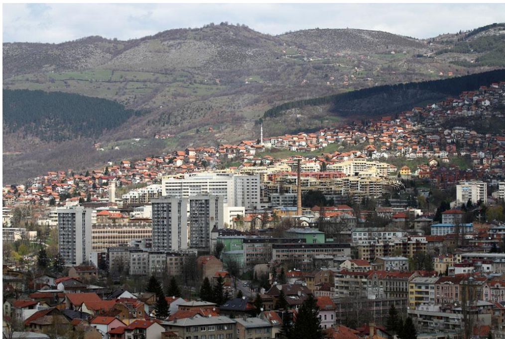
Figure 4. Urban Sprawl on the Hills Around Sarajevo

Dissolution of the society is led to the dissolution of space; therefore strengthening the community should lead to the unification of community space. Future spatial integration of settlements depends of the ability of society to integrate at a higher level from the family level.