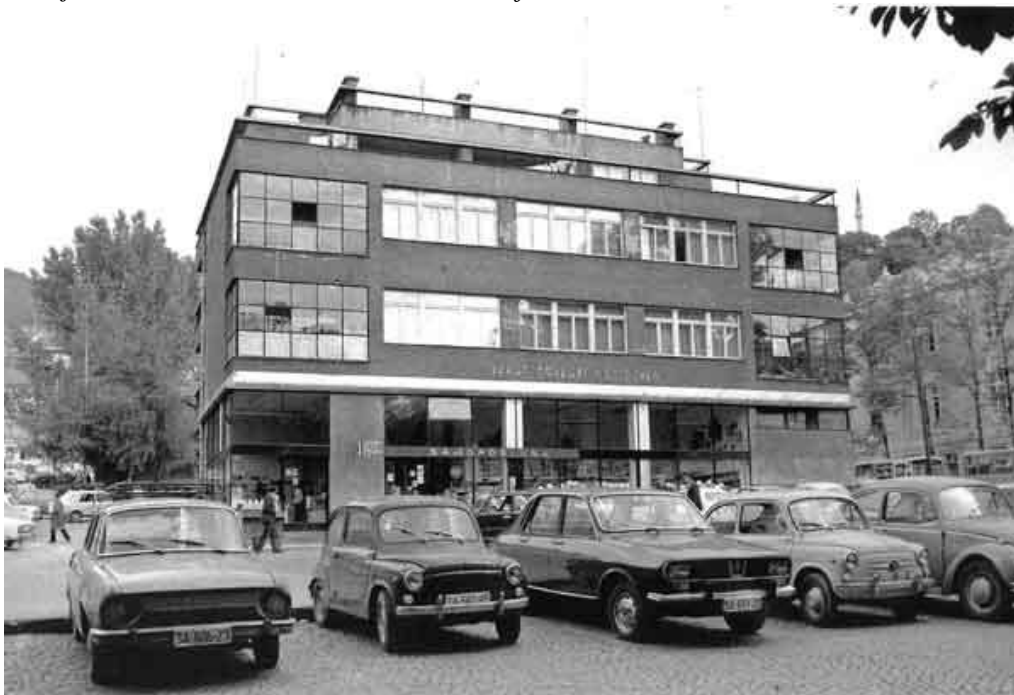
Figure 1. Private Interventions on Existing Apartment Building on Bistirk, Sarajevo, architects: Muhamed and Reuf Kadić, 1939. / 2013

The privatization of the existing housing stock that was conducted after the war, in 1995, turned the tenancy rights into property rights. This was reflected in the transformation of the existing collective housing. Apartment owners have felt free to modify residential space under their own discretion, which was not previously the case. Most interventions were based on improving the quality of housing in terms of restoration of the facade, windows, etc.. Interventions were individual, not coordinated, resulted in changes in the facade and exterior, depending on the preferences and capabilities of individual owners of apartments. This was reflected in the external appearance of the buildings, in terms of colours and types of facades, windows, etc. The individual, not collective approach to the reconstruction of apartment buildings is reflected in the appearance of existing collective housing (Figure 1 and 2). Activities of individuals in favour of their own interests dominated over the post-war reconstruction of existing housing stock.