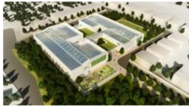
Figure 1. P.S. 62 Net Zero Energy School, before CASE analysis.