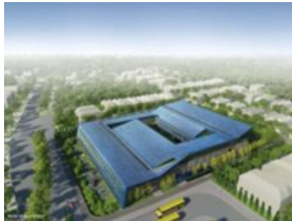
Figure 2. P.S. 62 Net Zero Energy School, after CASE analysis