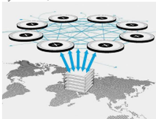
Figure 4. Diagram of Studio-X,

The radical nature of the program allows for an expansion of the boundaries of education, and also allows a much wider audience of participants and players. The mobile structure opens itself to many forms of intelligence held by figures both within and outside of the architectural discipline. Much like AMO, the mission of Studio-X is based on a model of complex and unlikely cross-pollination, with the desired outcome of newly emerging mutations. The program is constructed of nebulous relationships and shifting contexts that challenge the conventional balance between a centrally fixed base of power and peripheral obedience. They are essentially working to level and expand the field of play. With locations in seven cities around the world, including New York, Mumbai and most recently Tokyo, the program ensures that it has the ability to both see and hear, while being heard and seen in every part of the globe (Fig 4).