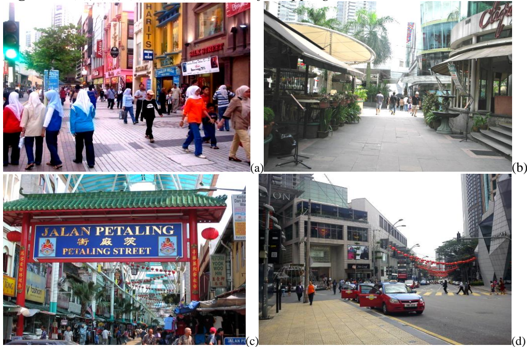
Figure 2 (a), (b), (c) and (d). Views of Shopping Streets

It is found that the visitors have a positive response when asked about whether they have a pleasant walking in the area. The pleasantness is mainly associated with experiencing the expression of culture. However, one of the respondents mentioned that he can feel the pleasantness only when the sunshine is not too strong. It is also claimed that very limited number of parks in the city centre that they can feel relax but the opposite feeling can be strongly felt in the city centre due to the intensity of traffic. The Kuala Lumpur City Centre Park is thought to be very nice and cooling except one who responded that the place is not attractive visually. But the walking is enjoyable due to the presence of buildings in the area. A lot of trees and bridges, as well as fountains, give a relaxing feeling. Respondents also associated the pleasantness with the shopping activities and the sights and sound of the places with its multi-cultural diversity.