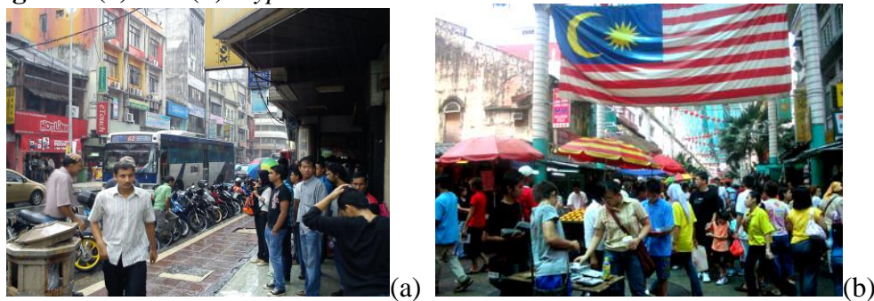
Figure 3 (a) and (b). Typical Street Scenes

Based on the interviews, the respondents found that the location of the