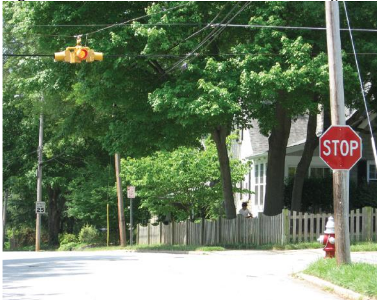
Figure 1. Intersection Standard Overhead Flashing Beacon

There are concerns that these beacons give the false perception to the cross-street drivers that all the flashers are red. The objective of this study is to evaluate the safety effectiveness of intersection overhead flashing beacons in the state of Texas and identify the locations where these treatments are most effective in reducing the crashes.