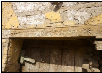
One of the Wooden Lintels in Civil Archaeological Buildings of Isna City

In this study, two different examination techniques were used, scanning electron microscopy (SEM) and fourian transform infrared spectroscopy (FTIR), to examine some deteriorated samples from historical and archaeological buildings, which showed various degrees of deterioration of the wood surface and the changes on the main chemical compounds of wood.