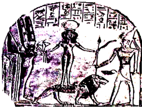
Pl.1. Reshep and Qedesh, nr. 50066, (see: Tosi & Roccati, 1972: 102-4, 290)

This Paper seeks to clarify the whereabouts of the stelae of Rameside Period, depending on: (1) their position in the tombs, in the broad hall, in the width hall, or in the shrine of the tomb. (2) their shapes; as a rounded-top, square-shaped, false-door, or rectangle Stelae. (3) The division of the surface of the stelae (4) The Lunette. (5) The deities who are depicted in the scenes, and the lunette. (6) The representation of the owner of each stela.