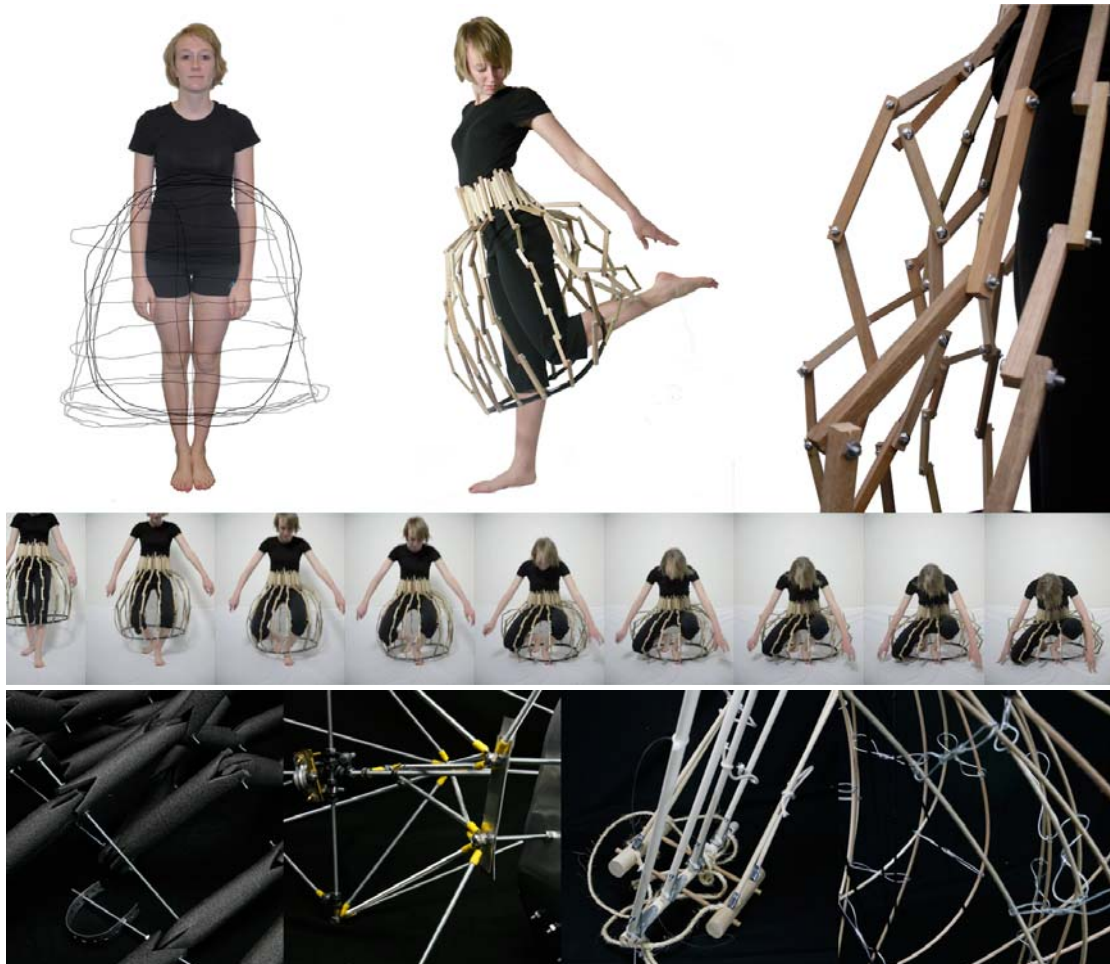
Figure 1. Student Projects from Wearable and Movable Architecture

Assistant Professor, Texas A&M University, USA