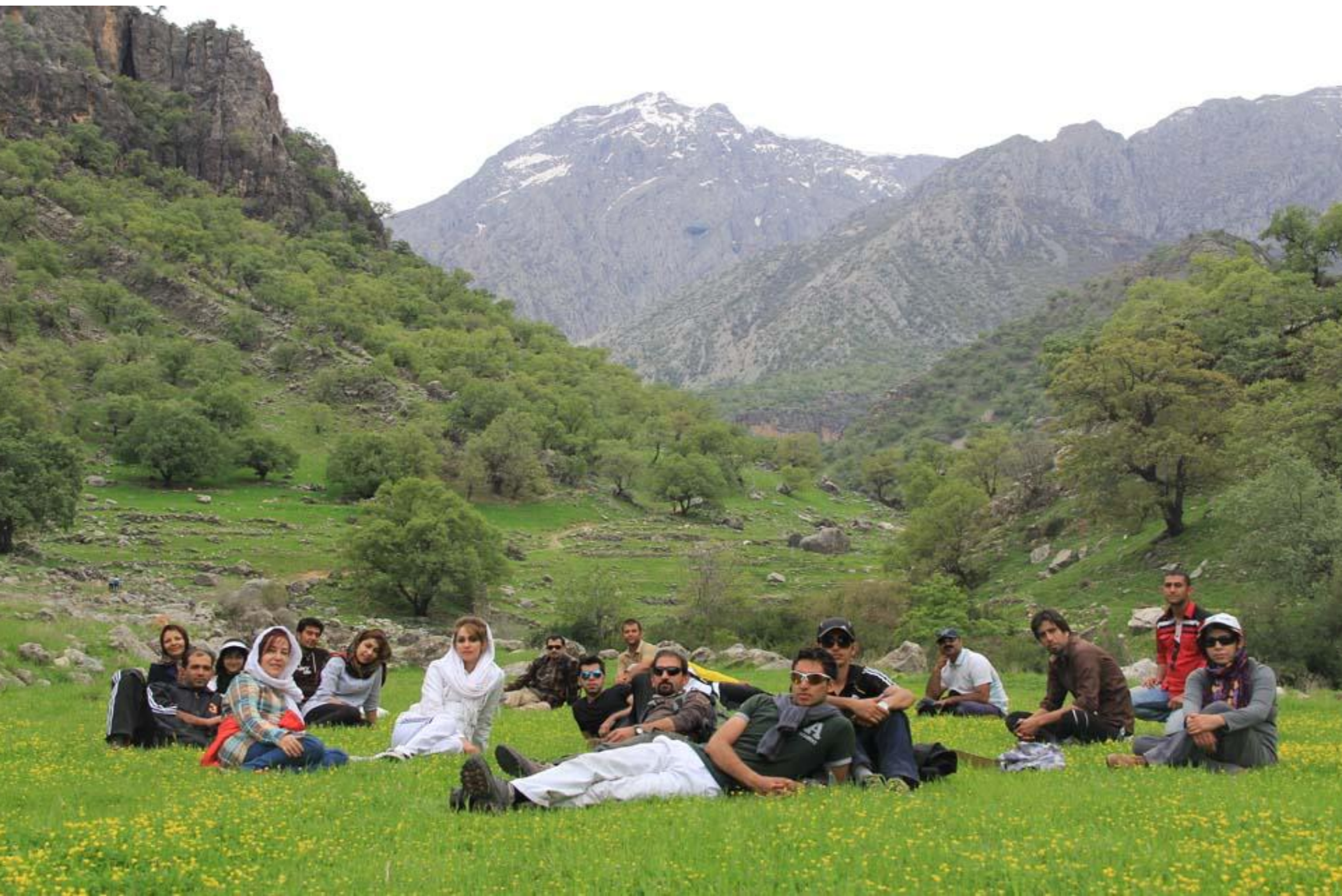
10th Annual International Conference on Psychology, Athens, Greece, May 2016