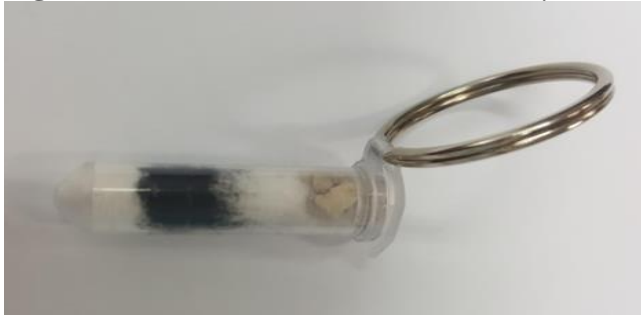
Figure 3. A Miniature Water Filter on a Keychain

At the end of the lesson, the pupils built a miniaturized version of the water filter, and connected it to a keychain they got as a gift (Fig. 3).