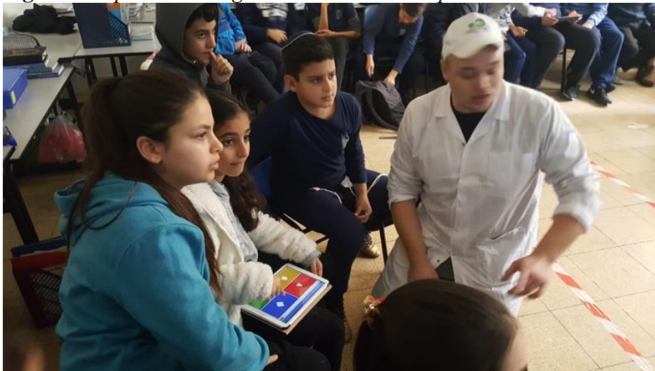
Figure 1. Pupils answering the “Kahoot!” trivia questions

In addition, surveys were held among the school staff, to examine satisfaction levels. At the end of each lesson, the teachers were asked to give their assessment of the pupils’ participation levels, their level of understanding, their enjoyment of the lesson, and the teachers’ own level of satisfaction from the lesson. They were also asked to give constructive notes and comments for future improvement.