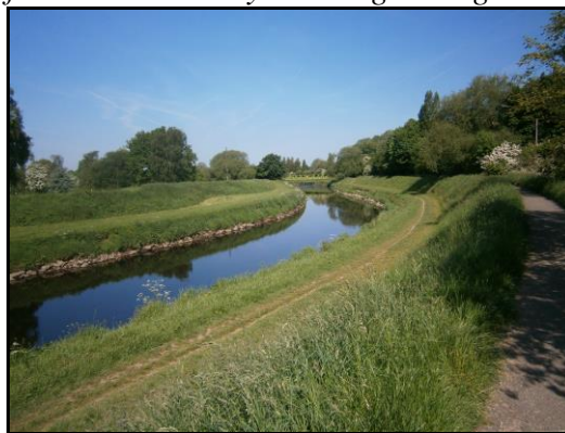
Figure 1. Section of the River Mersey Running through Didsbury

Within the basin, there are two residential properties and a number of local amenities such as recreational land, a rugby club and clubhouse, football club, a golf club and allotments. Under the Reservoirs Act 1975 , with additional clarity now provided by the Flood and Water Management Act 2010 , the flood basin was not deemed to be operating adequately (Environment Agency, 2010). The body in England responsible for the implementation, management and