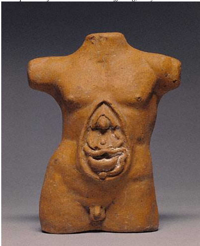
Figure 10. Depiction of Viscera in Votive Offering, Italy

broken (or rheumatoid) fingers; but typically all we have is a foot, which could imply anything from dropsy to paralysis to an ingrown toenail. Nevertheless, we can hypothesize to a reasonable degree about the kind of people who visited the sanctuaries and what illnesses they had hopes of being cured. We have, therefore, a database for information on ancient disease and healing which goes beyond the limited case histories in the Hippocratic writings and the medical texts of physicians like Galen, Celsus, and Aretaeus of Cappadocia.