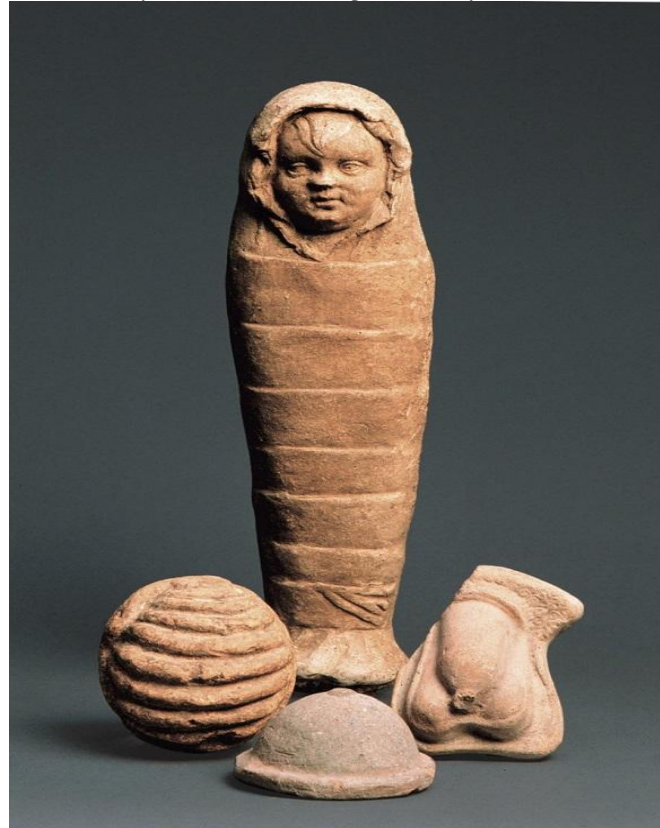
Figure 8. Swaddled Baby and Sexual Organs, Italy

Female genitalia and breasts, as well as swaddled babies, are very frequent at other Italian sanctuaries (Figure 8). This proves an emphasis on female fertility and childbirth, since male genitals are at the same time scarce or nonexistent. At the religious center of Gravisca, which was the port city of Tarquinia, we have in one room alone of the religious complex 222 uteri. The goddess worshipped here was Uni (= Juno), who was in charge of fertility and infancy. The swaddled babies do not represent, in all likelihood, sick children, but a thanksgiving offering for a child delivered safely or even a wish for pregnancy. 2 Another goddess in charge of fertility and safe pregnancy was Minerva (or Minvra). The votives at her sanctuary at Lavinium contains almost exclusively swaddled babies along with breasts and uteri. 3 What do the uteri represent? The answer is fertilized wombs (Figure 9). When the uteri at the