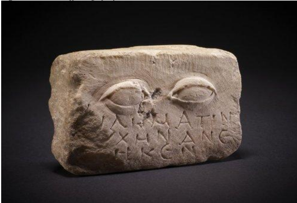
Figure 3. Votive Offering of Eyes, Athens

Eye problems were a major concern at the center of Asclepius at Athens, which is located on the southwest slope of the Acropolis. 1 Forty (40) percent of the votives, or 154, are eyes (Figure 3). Just as Corinth specialized in limbs and appendages as well as venereal disease, Athens seems to have been particularly well-known for curing ocular problems. In fact diseases associated with the head or parts of it seem to have been the overall specialty. Besides the 154 eyes, we have 25 ears (13 single ears, and six pairs) and 17 faces; the faces are harder to interpret, since the ailment could have been anything from skin ailments like pimples and acne to nasal conditions and the sinuses. There were two subspecialties at this cult center: feet and legs (41 legs: 34 single legs, and seven pairs; 12 feet), and sexuality (votives of male genitals and female genitals and breasts), although not to the same extent that we see at Corinth (Figure 4).