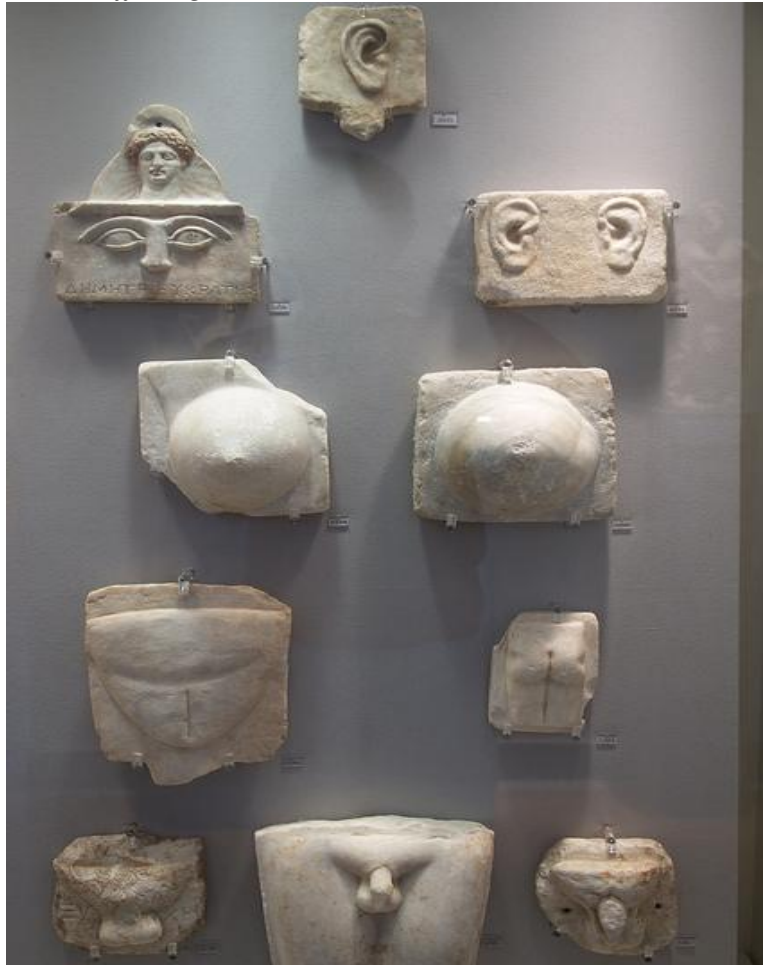
Figure 4. Votive Offerings, Athens

Not too far from the Athens sanctuary of Asclepius is the Sanctuary of Zeus Hypsistos on the Pnyx Hill. 1 This place emphasized gynecological matters, as over 60 percent of the votive offerings are female breasts and female anatomy, including vulva and abdomen.