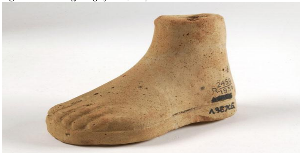
Figure 5. Votive Offering of Foot, Italy

At Ponte di Nona, about 10 miles east of modern Rome, a large sanctuary dedicated to an unknown deity was discovered. 1 Anatomical votive offerings were found in two pits; one pit is inside the temple area, while the other was dug in a dump area north of the temple. Over 8,400 body parts have been recovered, and may be grouped into three major specialized areas of healing. Nearly three-quarters of the finds (nearly 6,000) are feet and hands, and arms and legs (Figure 5). In antiquity, this was a rural sanctuary and would have served an agrarian population. Given the profile of the people who came (peasants, farmers, laborers), it is not unexpected that we find limbs and appendages. Workers and farmers would have received many injuries, cuts, and contusions to their hands and arms, and feet can be bruised, ankles twisted, joints dislocated, and so forth, while toiling in fields. And of course a pedestrian, heavy walking lifestyle typified them as well. 2 Indeed, the common foot ailments we treat easily today (fallen arches, ingrown toenails, torn ligaments, wounds, ulcerations, arthritic joints) were serious matters back in antiquity and posed dangers to the sufferer. The very high number of feet and legs (as well as hands and arms) as votive offerings at Ponte di Nona demonstrates that the people who came there were anxious for a cure and, evidently, found it.