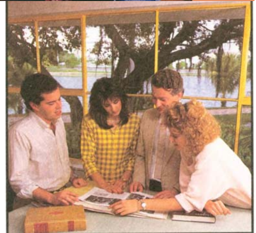
As Interim Dean with students, 1983