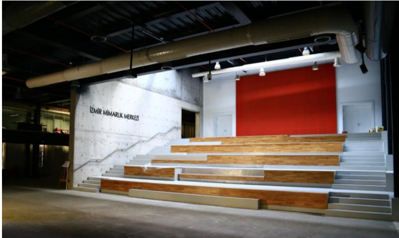
Fig.1. Entrance of the space-Informel stage